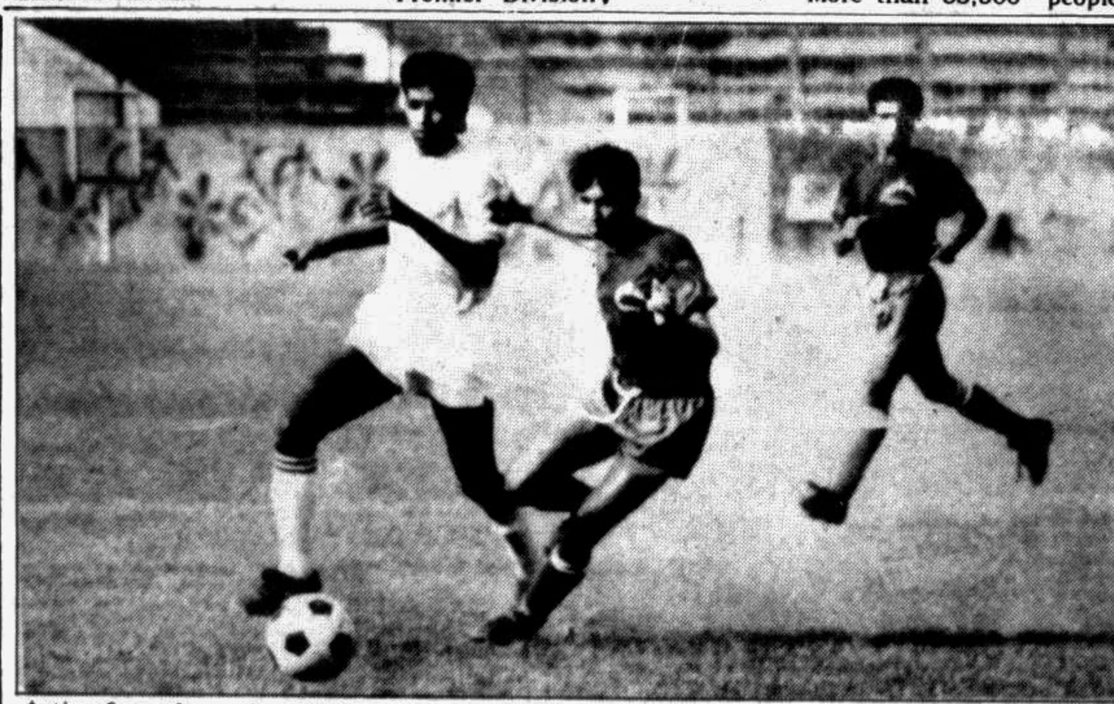
Action from the under-16 BFF talent hunt soccer tournament which began yesterday at the Mirpur Stadium.

A new national record was created on the second day of the Army Athletics meet-91 at the Army Stadium at Dhaka Cantonment yesterday, an ISPR press release said, reports BSS. Nk Muhammed Mustafa Talukdar of the Chittagong area team set the record in hammer throw clearing 56.50. The previous record in the event was 55.12 mtrs. The Chittagong area team with 5 gold, 3 silver and 3 bronze were leading the medals' table while the Savar area team with 2 gold, 2 silver and 2 bronze and the Rangpur area team with 2 gold and 2 bronze medals were on second and third spot.