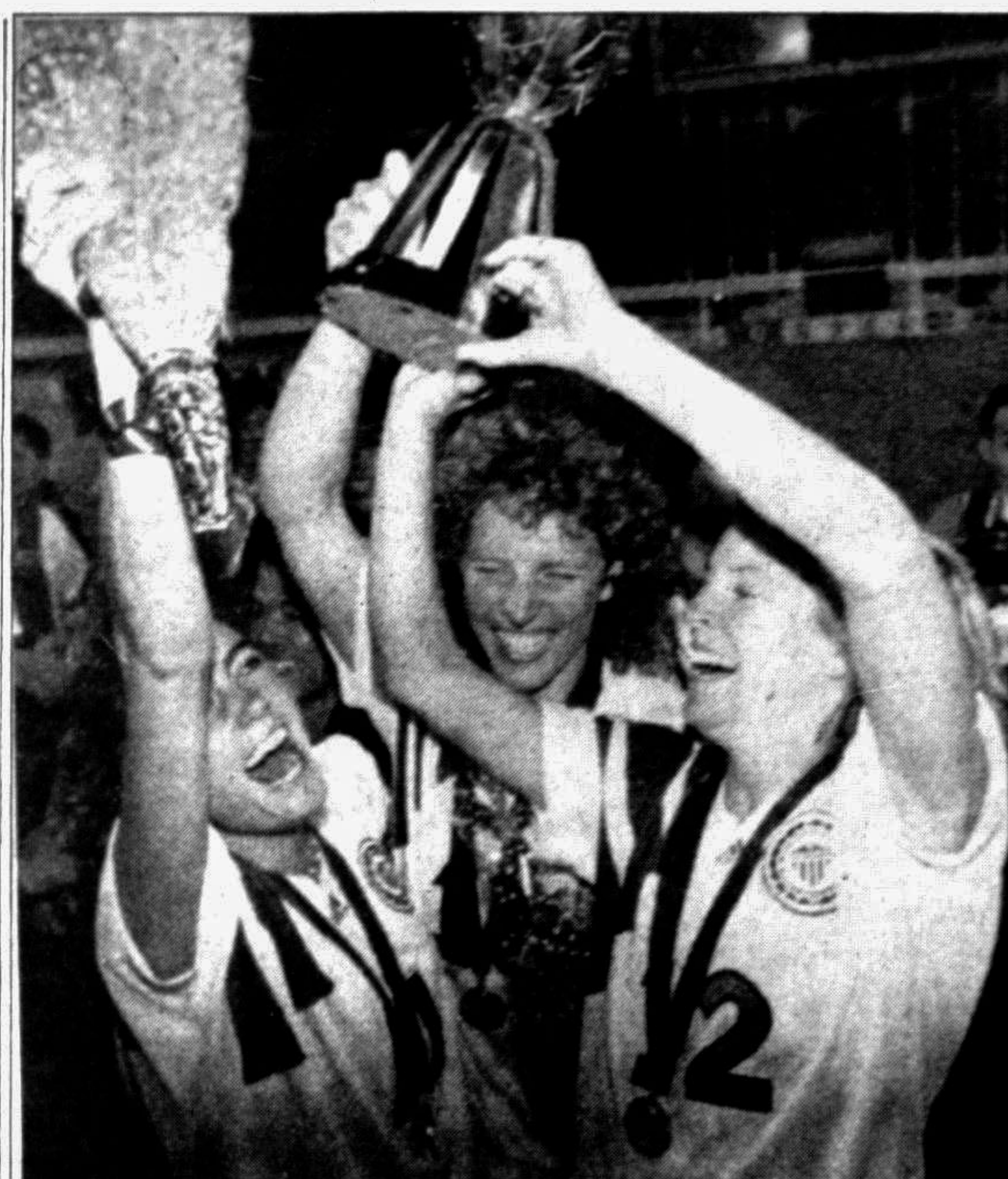
Michelle Akers Stahl (C) who scored two goals for the USA to win the 1st women's World Cup football title, holds the trophy together with teammates Julie Fondy and Carin Jennings (R) in Guangzhou, China on Nov 30. USA beat Norway 2-1.