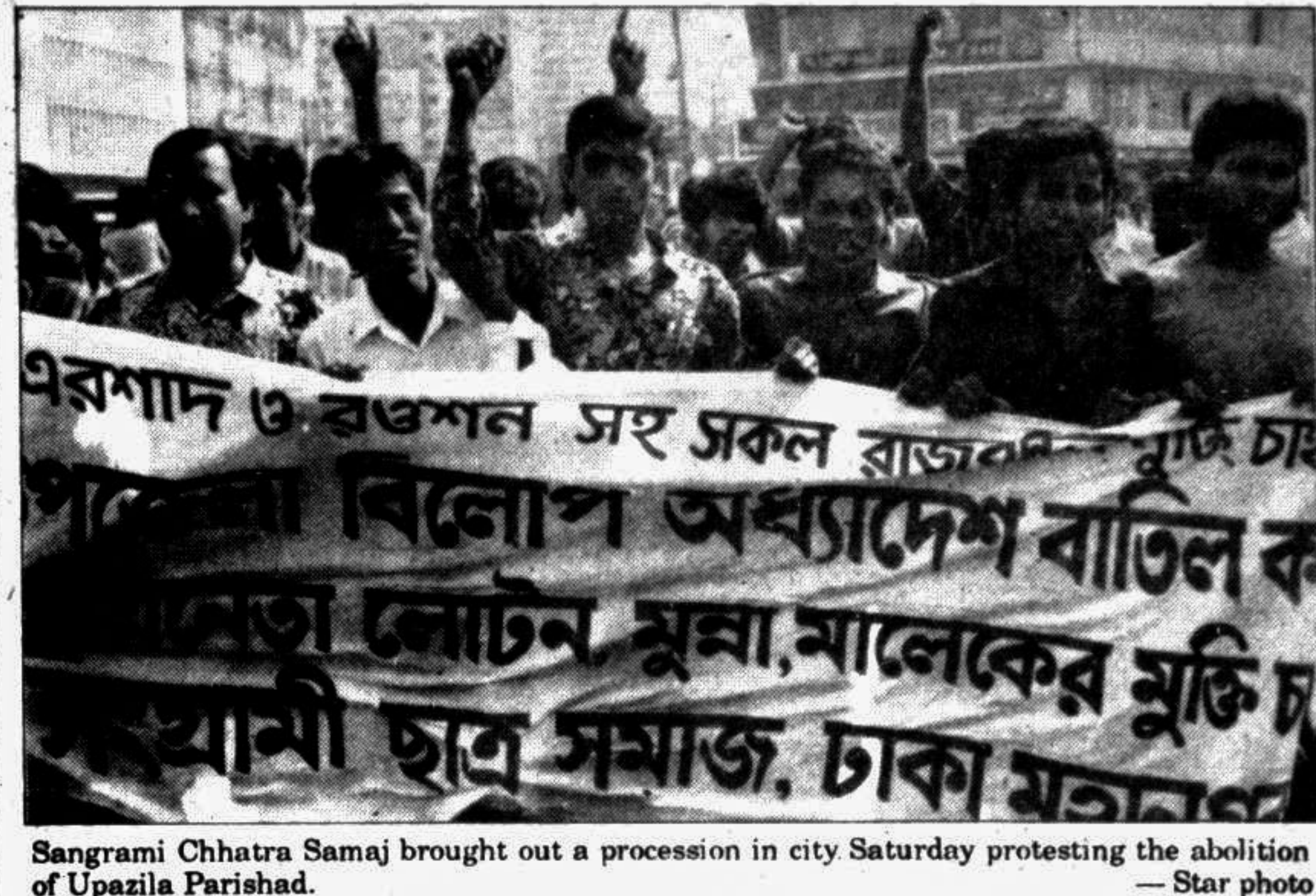
Sangrami Chhatra Samaj brought out a procession in city Saturday protesting the abolition of Upazila Parishad.