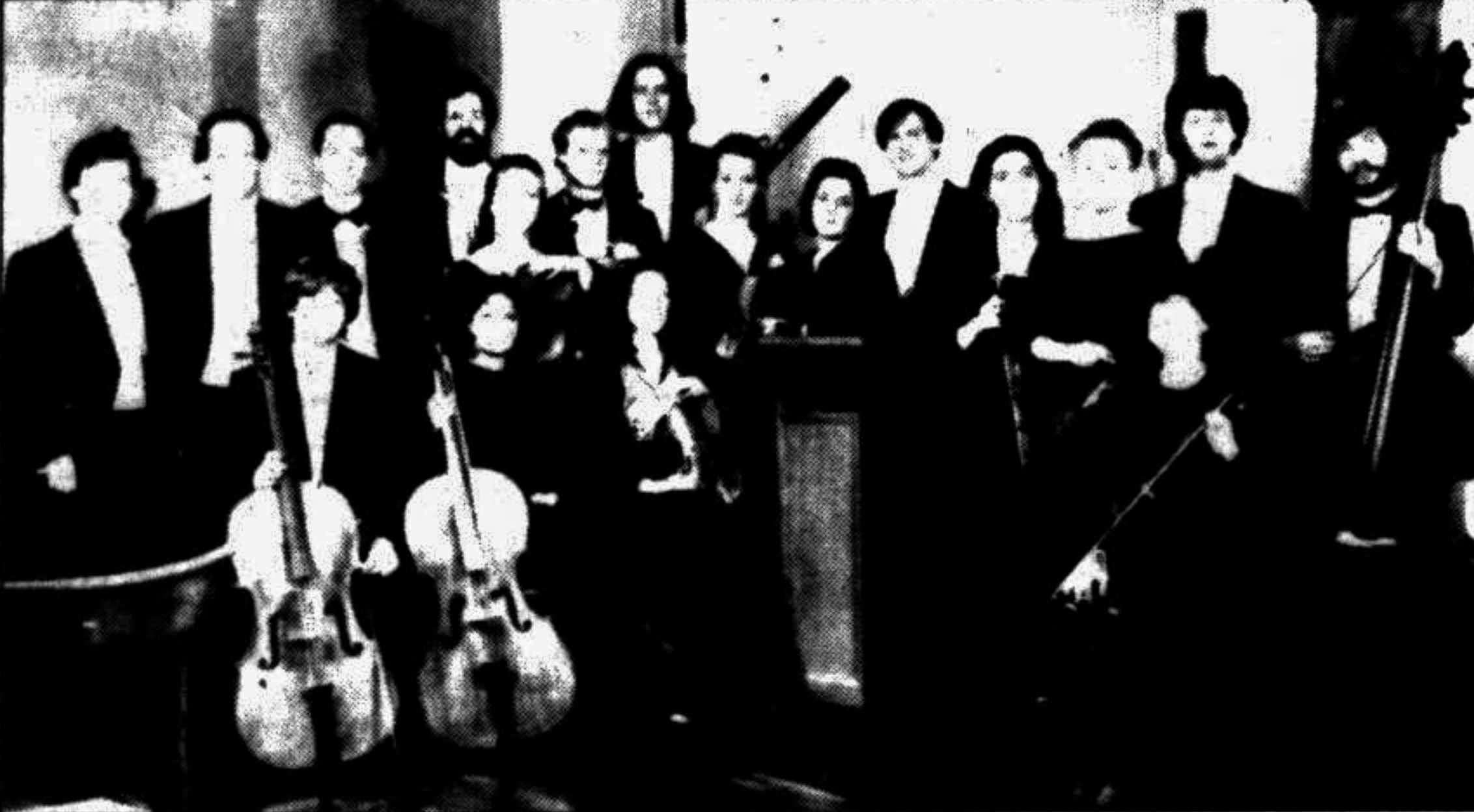
Concerto Koln from Germany: 'You announce Mozart, everyone comes.'

"Concerto Koln" he has been to South East Asia — Thailand, Indonesia, Malaysia and Europe. Talking about his experiences in the east, he said that he found the people "extremely open and friendly" but that he could not understand the slaughtering of animals on the open roads and the floating of dead bodies of beasts in the rivers as he witnessed in Nepal.