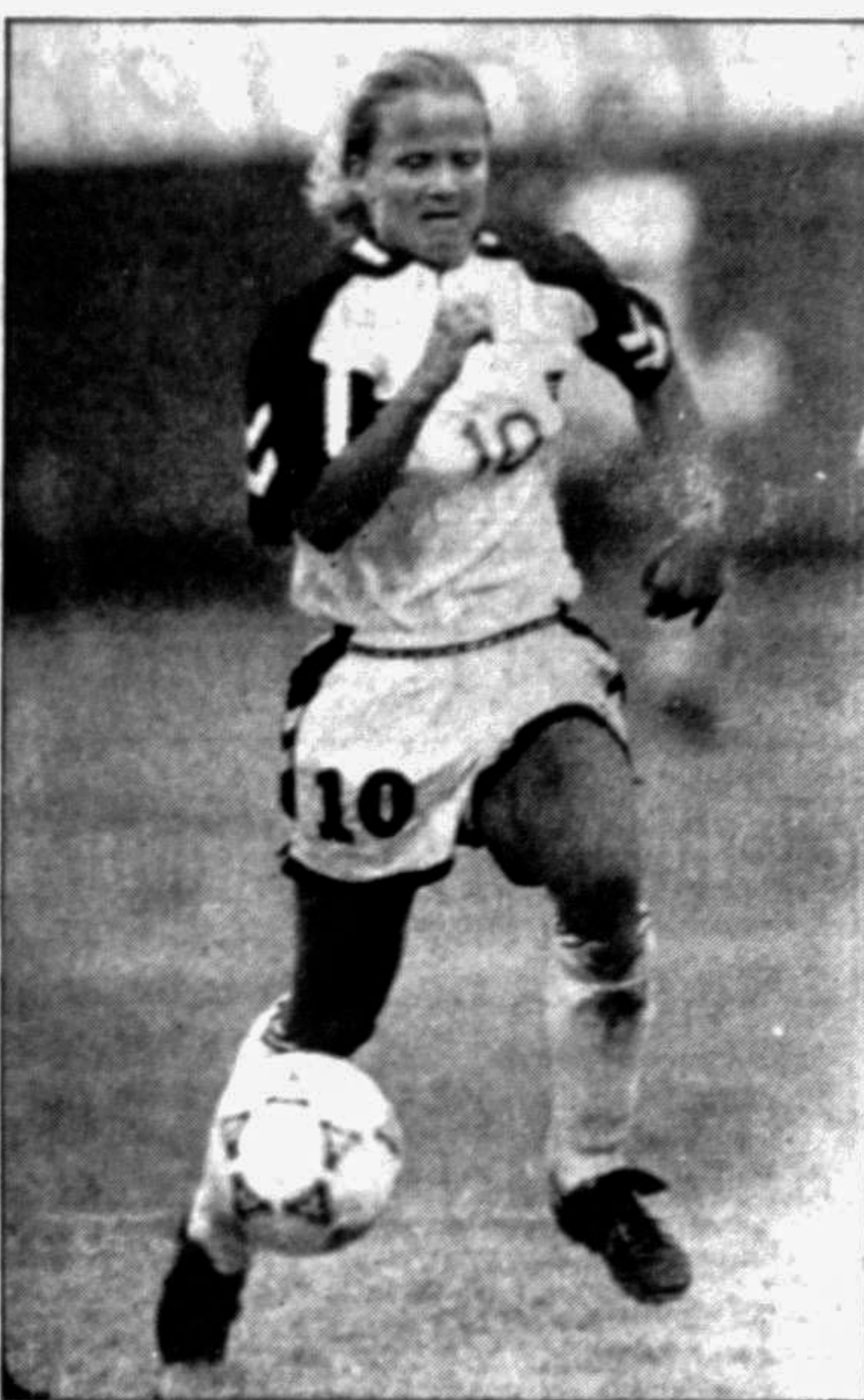
Norway's main shooter Medalen dribbles down the field during the semifinal match between Norway and Sweden at the first women's World Cup soccer championship in Guangzhou, China on Nov 27. Norway beat Sweden 4-1 and will play against USA on Nov 30 for the title.

partner Zahed Razzak Masoom — who moved over from Brothers Union — have featured in a record opening stand of 247 against the hapless Ajax Sports Club in their opening encounter of the meet. And in the semifinal against Gulshan Youth, Lamba and Masoom punished the attack for another mammoth 169-run first-wicket stand. Masoom, too, has shown terrific form with the bat, having hit a century and another fine 66 in the semifinal. Besides these two, the Abahani line-up possesses a solidity with skipper Farooque, Akram Khan, Shujon and