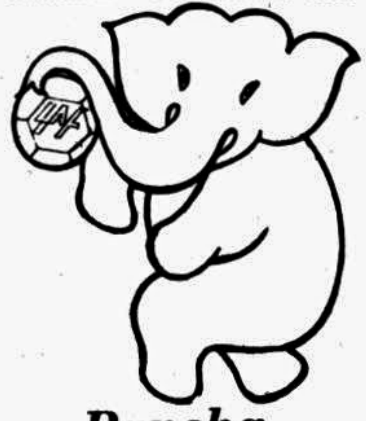
Pancha, the Games mascot

Meanwhile, five national federations have finalised their