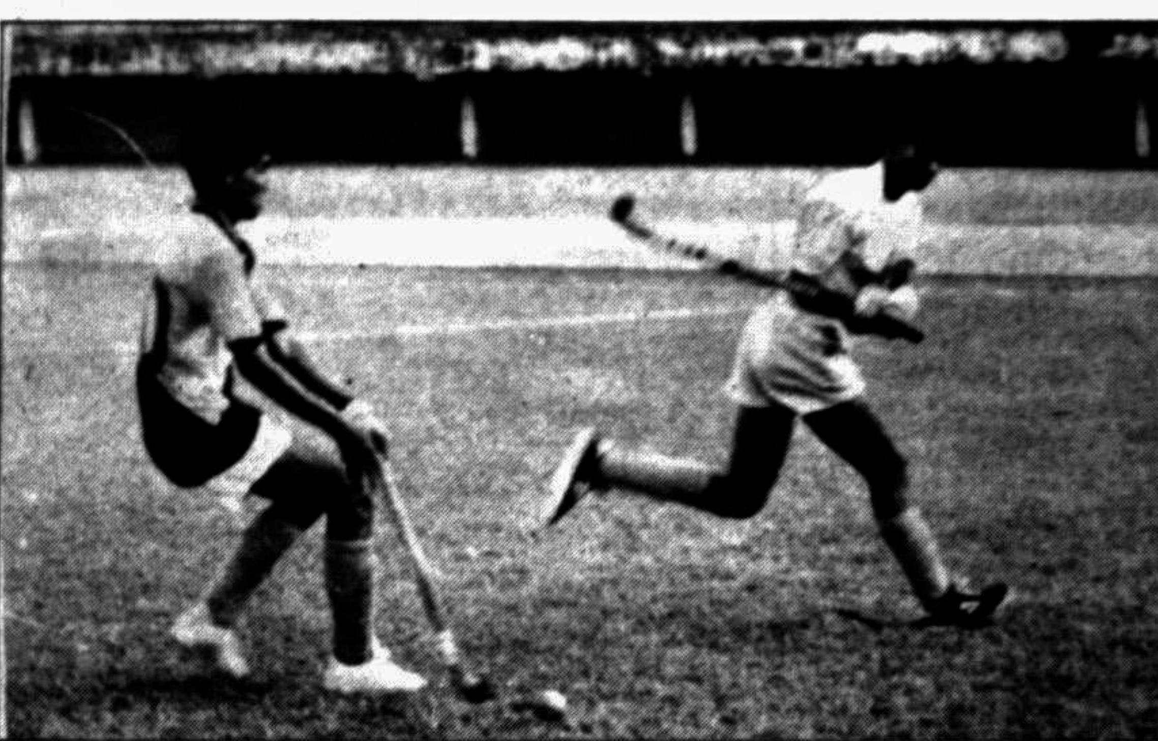
Action from yesterday's Green Delta hockey super league match between Cantonian and Udy Club held at the Hockey Stadium. Cantonian Club defeated Udy 2-0.