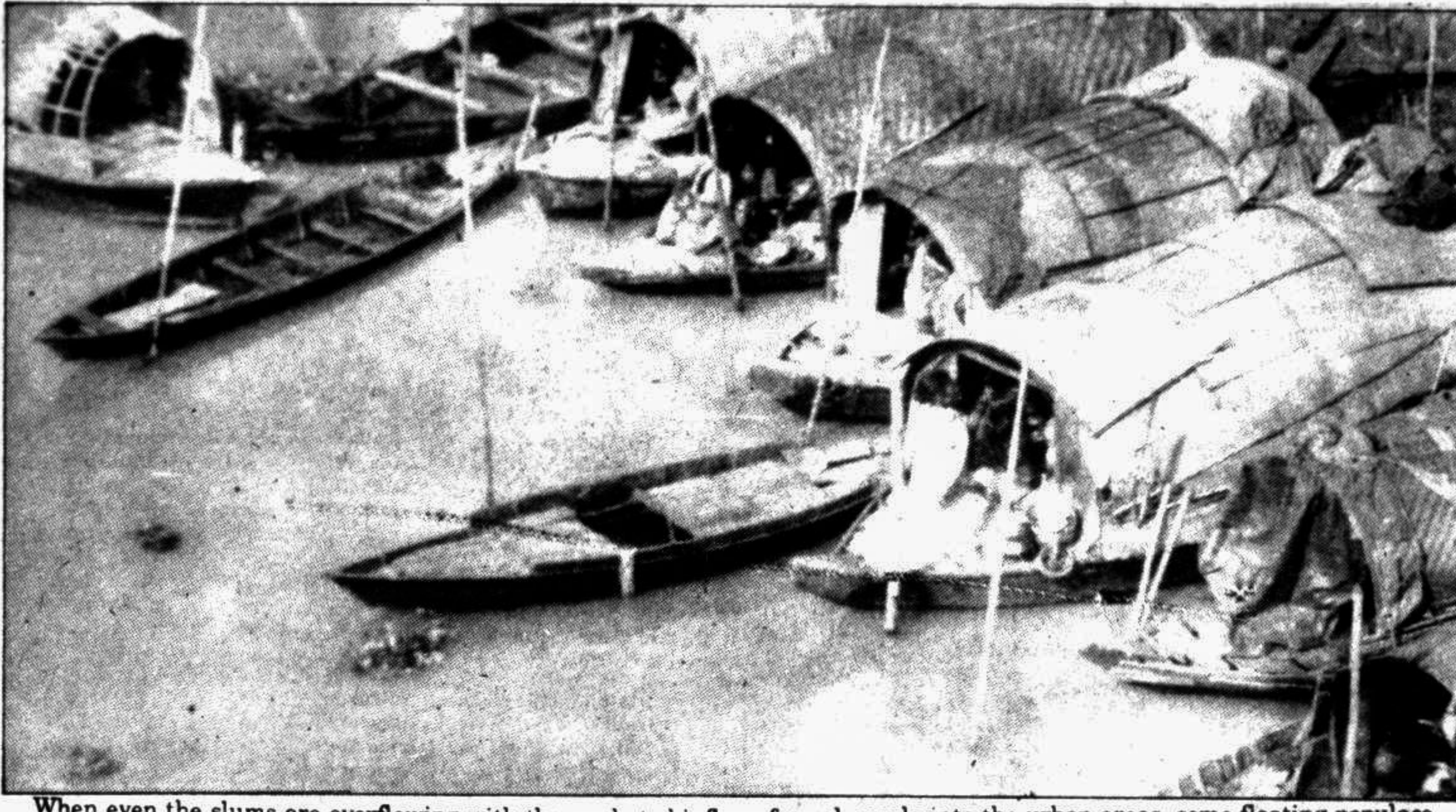
When even the slums are overflowing with the unabated influx of rural people into the urban areas, some floating populace find shelter in literally floating houses-boats in Narayanganj.