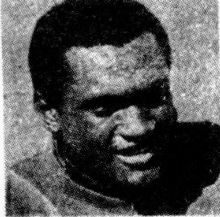
HOOPER... four for 34 runs to win, an impossible target considering the thin batting talent left.

Pakistan 57 for four in 17th over. Off spinner Carl Hooper then dismissed Imran Khan Richardson off Ambrose for 18. Miandad dropped twice at 21 and 29 off Hooper by Richardson and Anderson Cummins made 31 before he too perished. In the last four overs Pakistan required 40