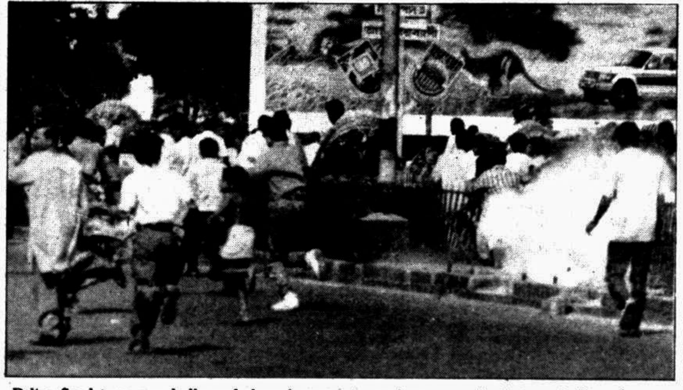
Police fired tear gas shells and chased garments workers near the Science Laboratory on Wednesday.

spot. None of the injured were taken to the hospital. The agitated workers marched towards Dhanmondi led by the Bangladesh Garment Sramik Karmachari Sangram Parishad after a rally in front of the National Press Club demanding withdrawal of lock-outs and closure of a number. See Page 12 Col. 6