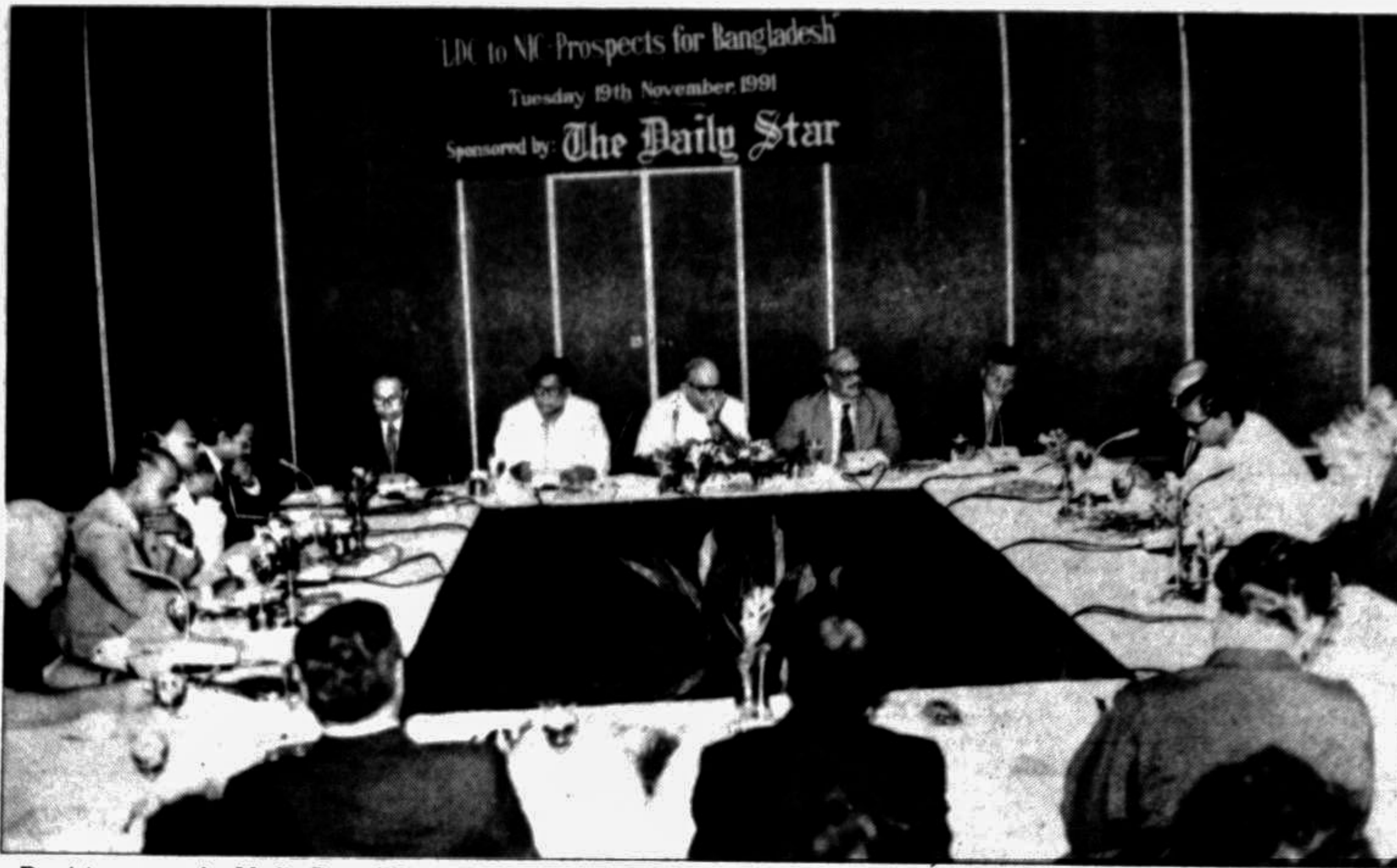
Participants at the Media Round Table on "LDC to NIC : Prospects for Bangladesh" organised by The Daily Star at a local hotel on Tuesday.

They also stressed the need for agreement on the trans-boundary movement of all radioactive materials, including fuels, spent fuels, and other wastes by land, sea or air and to evolve a code of practice on liability and compensation.