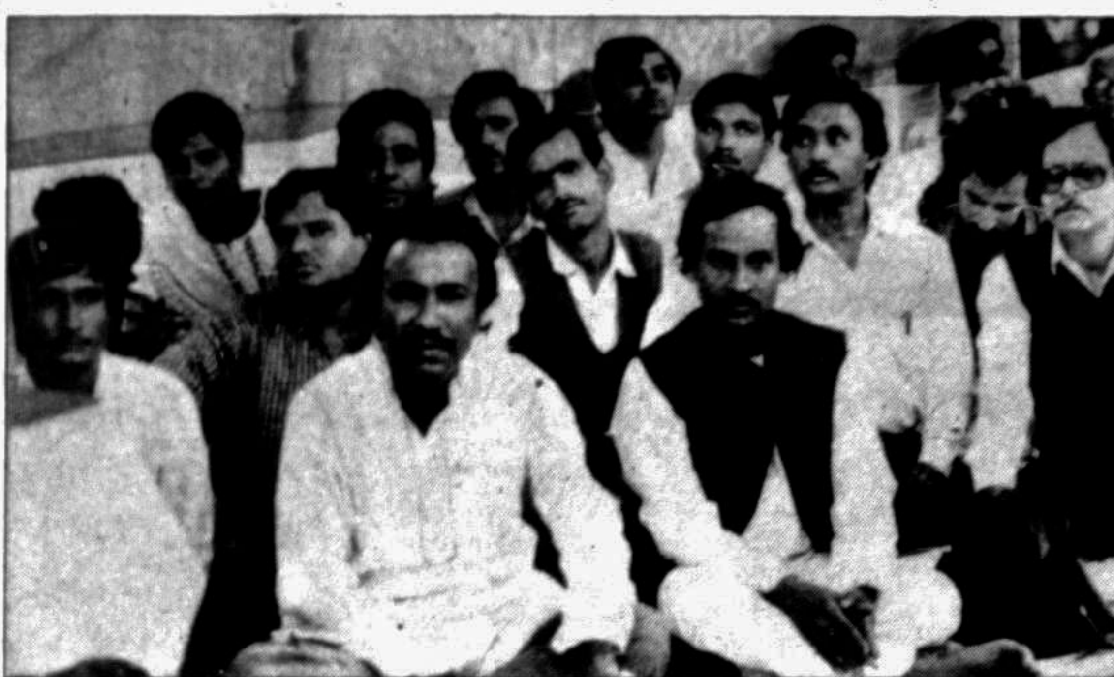
Members of Joy Bangla Sangskritik Parishad staged token hunger strike Tuesday in front of the National Press Club demanding repeal of Indemnity Ordinance.

The venue of the regular weekly meeting of the Rotary Club of Dhaka South, scheduled to be held today (Wednesday) has been shifted to the Board Room of Motijheel Nursing House from Hotel Purbani, a press release says.