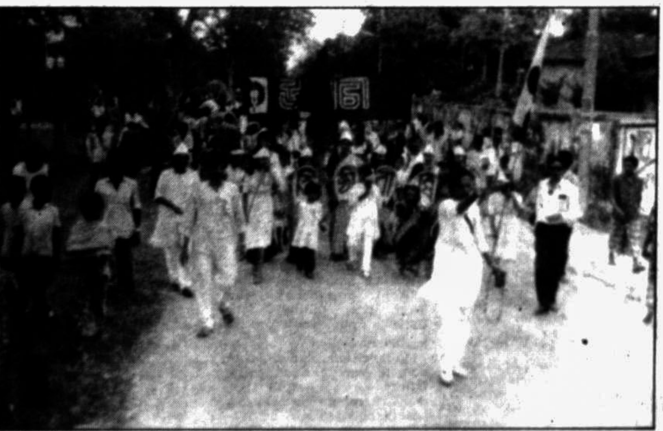
MADARIPUR: A colourful rally organised in observance of 23rd founding anniversary of Udichi Shilpi Gosthi parading the town street recently.

Easy availability of drugs has aggravated the situation further. According to sources, drugs are available in most of the medicine shops within the municipal area.