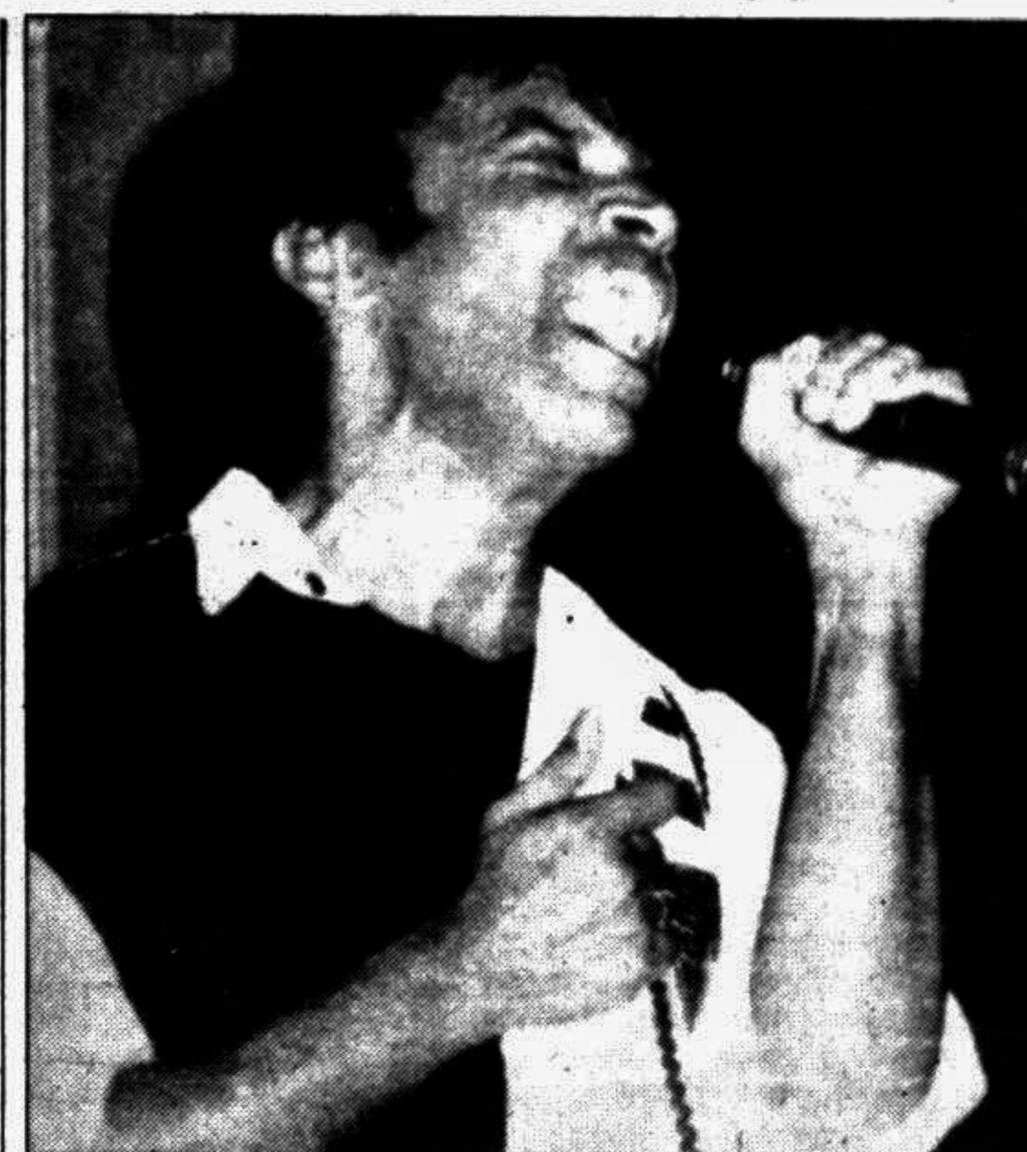
Noted Pakistani singer Alamgir performing solo programme at Soanagar Hotel Saturday. Inner Wheel Club of Dhaka North organised the programme in aid of the distressed.