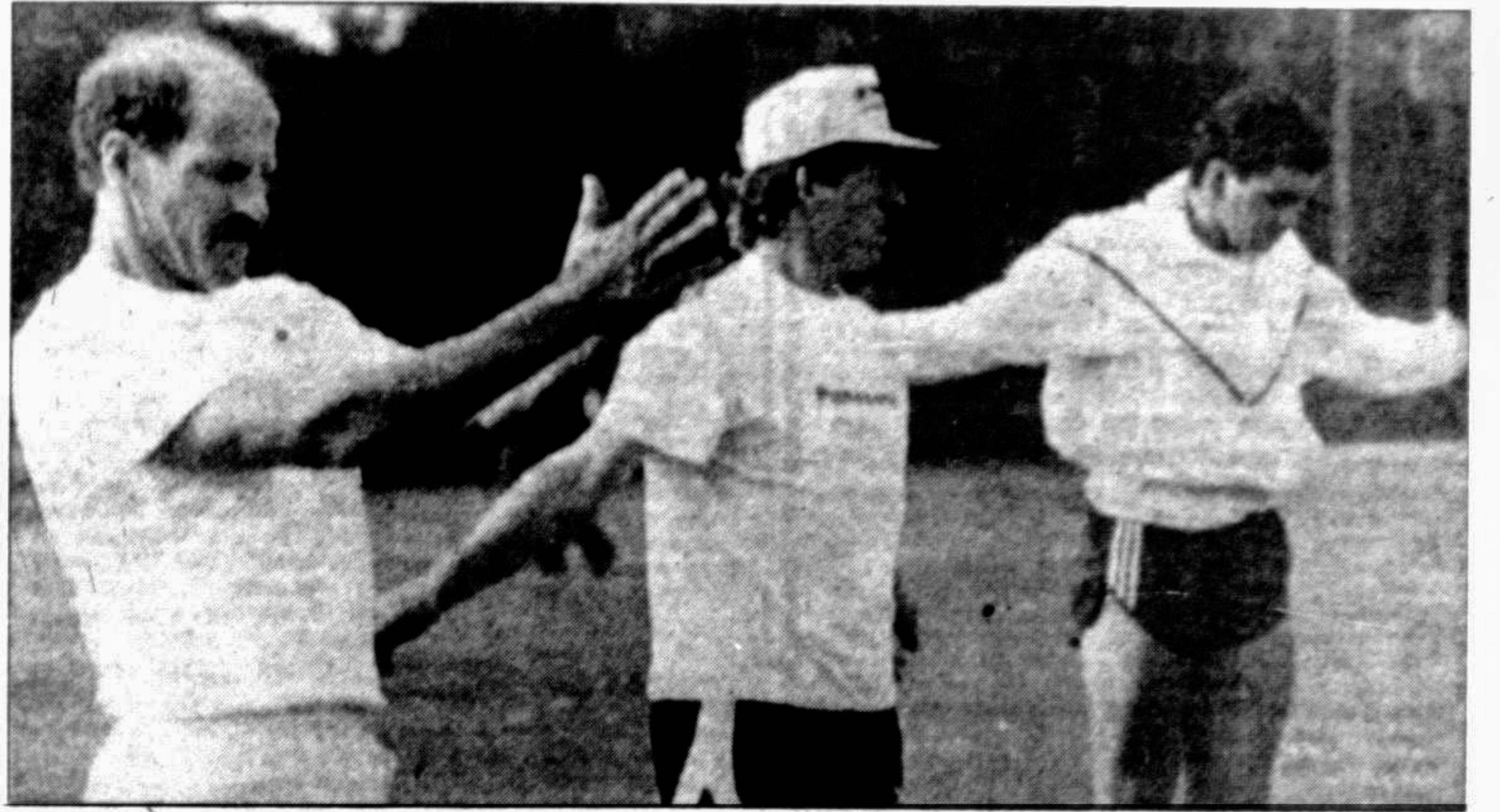
South African skipper Clive Rice (L) with his teammates Richard Snell (C) and Allan Donald (R) in their warm-up exercise in the Indian capital New Delhi on Nov 13 preparing for the last one-day international against India. India won the first two matches.