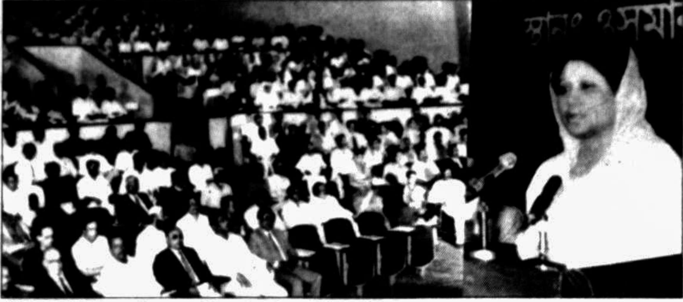
Prime Minister Begum Khaleda Zia addressing the Jatiya Samabaya Award, 1989 distribution ceremony at Osmani Memorial Auditorium Tuesday.

An Indonesian official, speaking on condition of anonymity, said they started to throw stones at a police station and attacked police and troops trying to break up their demonstration. The youths attacked police and troops with stones, sticks and knives, injuring one soldier seriously, added the official, who is very close to both East Timor and military authorities. The outnumbered police and soldiers fired in the air to stop the attack, he said. Troops continued to patrol the area after the clash, making arrests and questioning young people, the official said. The outnumbered police and soldiers fired in the air to stop the attack, he said. Troops continued to patrol the area after the clash, making arrests and questioning young people, the official said. Indonesian Foreign Minister Ali Alatas told reporters recently that Portugal wanted the visit and they postponed it, he said the two sides had agreed that each had the right to veto journalists wanting to accompany the mission. Alatas said it was up to the United Nations to reschedule the visit on terms acceptable to both sides.