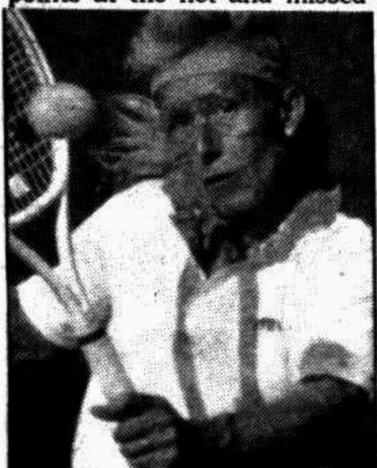
MARTINA NAVRATILOVA just one approach shot the entire match.

Navratilova won the match by playing aggressively and forcing Seles to pass her at the net. Navratilova won 73 of 124 points at the net and missed