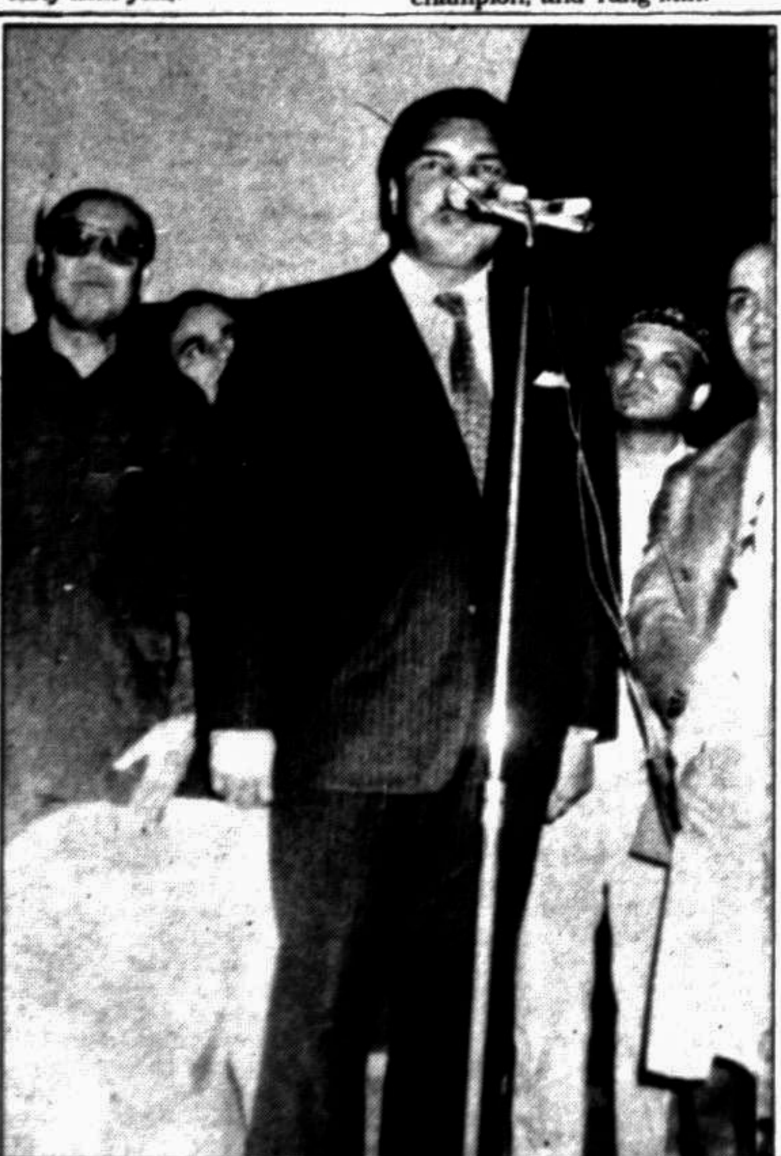
Former heavyweight boxing legend Muhammad Ali speaking in a recent religious discussion programme, organised by the Bangladesh Islami Council in Abu Dhabi. Bangladesh and Sri Lankan ambassadors Ahmed Farid and Mohammad Jamil are seen flanking Ali.

A total of 50 parachutists from Australia, Canada, China, Hong Kong, Indonesia, the United States and Japan competed in the event.