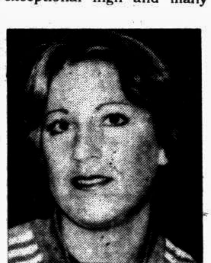
CHRIS EVERT points were won on outright winners in the one-hour and 42-minute match.

top-seeded Seles in other's service games resulted in 13 breaks of serve in 27 games. Still, the quality of tennis was exceptional high and many