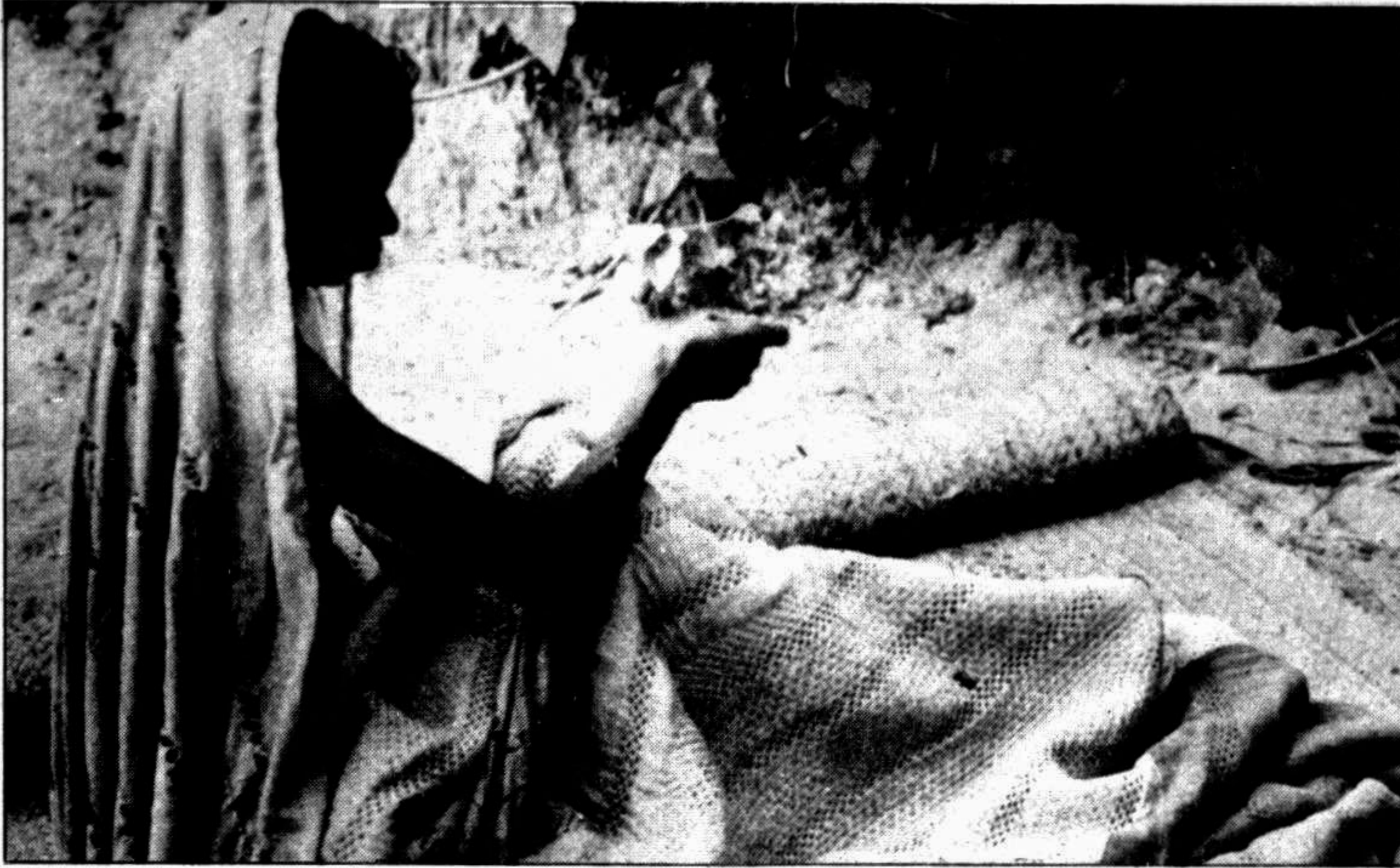
With the advent of winter well-to-dos both in towns and villages have started unpacking their preserved quilts and warm cloths. But the flood and erosion victims who have taken shelter on embankments in Rangpur are but to arrange for the cover all anew. Photo shows a flood victim in Gangachara sewing a 'Katha' (rag blanket) to save her children from the approaching wintery chill.

Nov 11: Trade Union Employees of Power Development Board (PDB) gheraoed the PDB office Tuesday to realise their overtime dues, reports UNB. Employee sources claimed that the authority has not been paying their overtime bill amounting to Tk 1.60 lakh since October last. But the authority denied to pay their bill stating that the employees did not work over time.