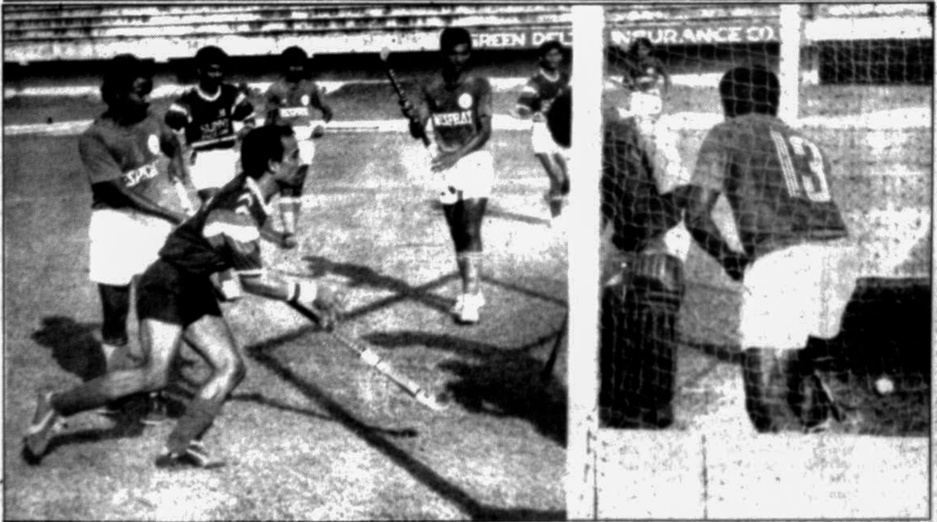
Scene from yesterday's Green Delta Second Division league match between Shishu Kishore and Muktiyodha Sanghad at the Hockey Stadium. Shishu Kishore won 10-11.