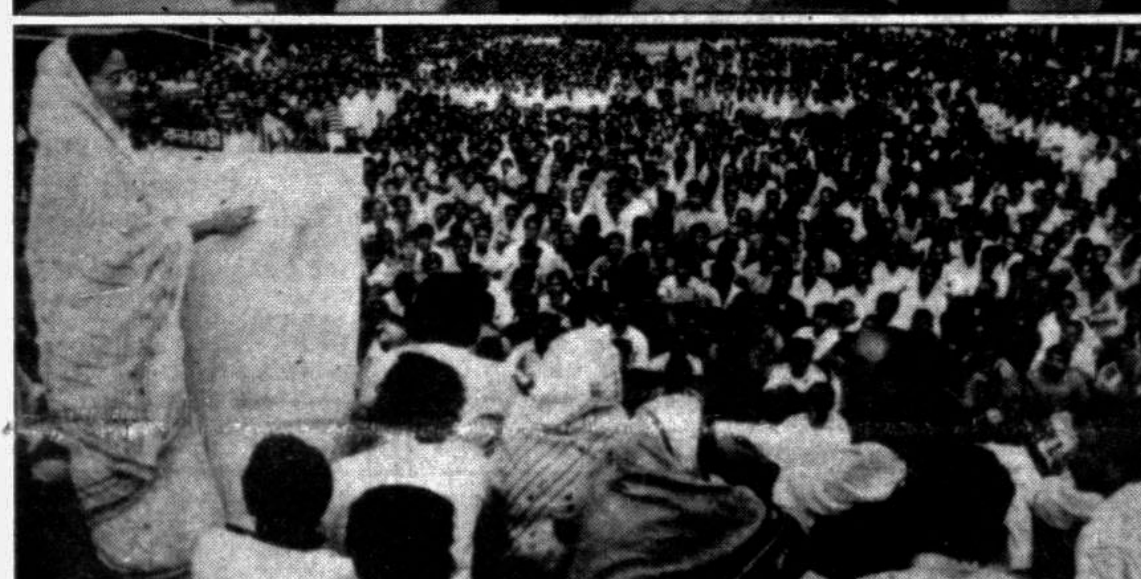
Top: A postal stamp commemorating Noor Hossain, a martyr of 1987 anti-autocracy movement, was released by Prime Minister Begum Khaleda Zia on Sunday. Middle: LGRD Minister and Secretary General of the ruling BNP Salam Talukder addressing a rally at Fulbaria. Bottom: Awami League chief Sheikh Hasina speaking at a rally at the Bangabandhu Avenue in the city.