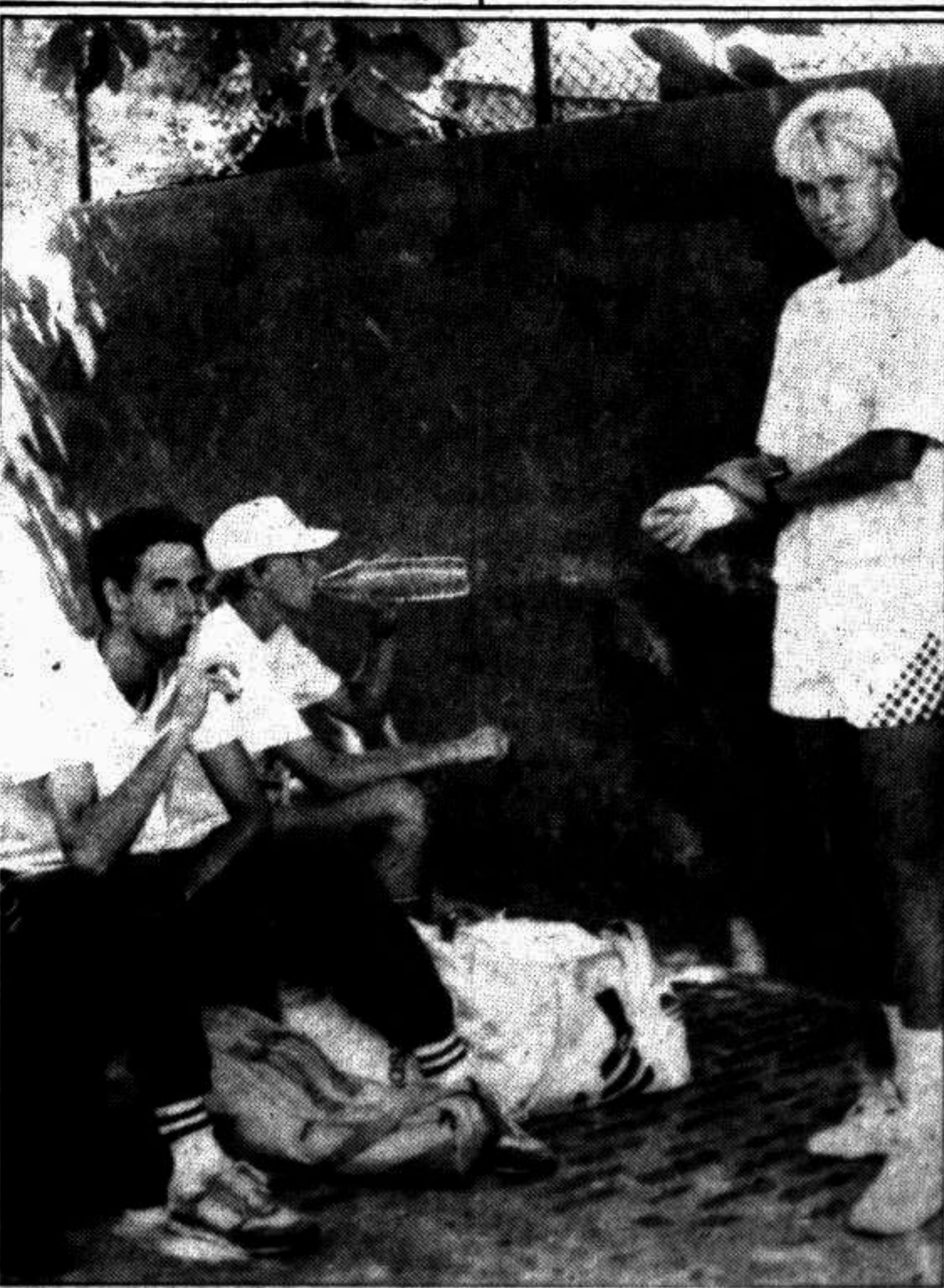
Some of the players taking part in the current ITF satellite meet cool off in the shade at the Ramna Tennis Complex yesterday.