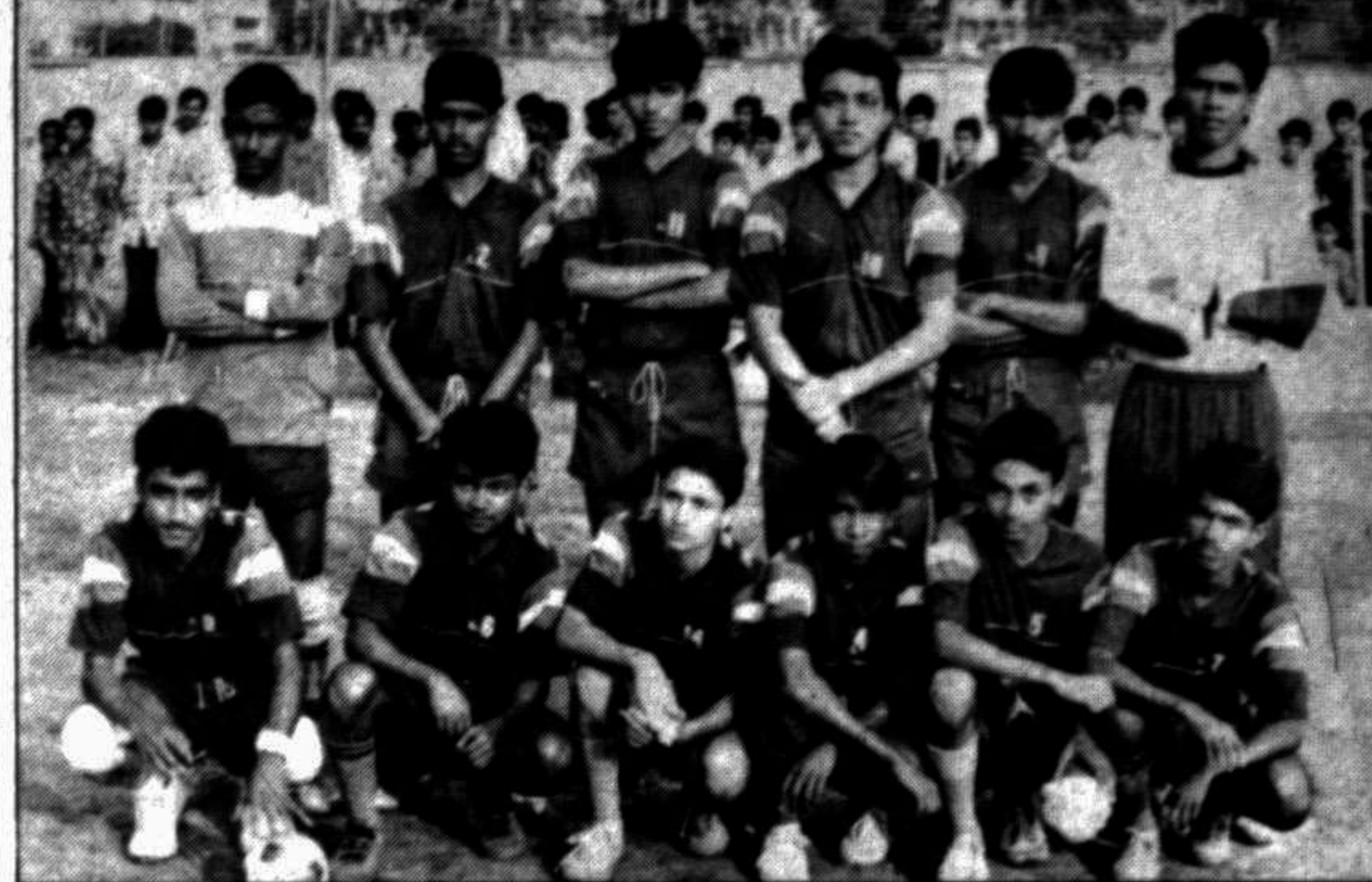
Narinda Govt. Boys High School became the champions in the fourth Bata handball tournament beating Shaheed Nabi High School 18-16 in yesterday's thrilling final at the Outer Stadium.