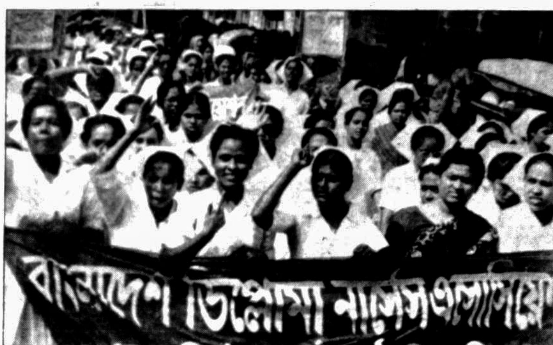
Nurses brought out a procession in the city Saturday in support of their demands.

Army personnel from the Bogra and Rangpur areas continued their relief activity at the flood affected northern districts, an ISPR press release said Saturday, reports BSS. They assisted the local administration in distributing two thousand twenty nine metric tons of relief goods including rice and wheat at different places of Rajshahi, Bogra, Naogaon, Nowabganj, Natore, Panchagarh, Pabna, Sirajganj, Rangpur, Dinajpur, Thakurgaon, Kurigram, Lalmonirhat, Gaibandha and Nilphamari districts during the last two days. They also assisted in distribution of more than nine lakh eighty thousand seven hundred Taka in cash and other essentials.