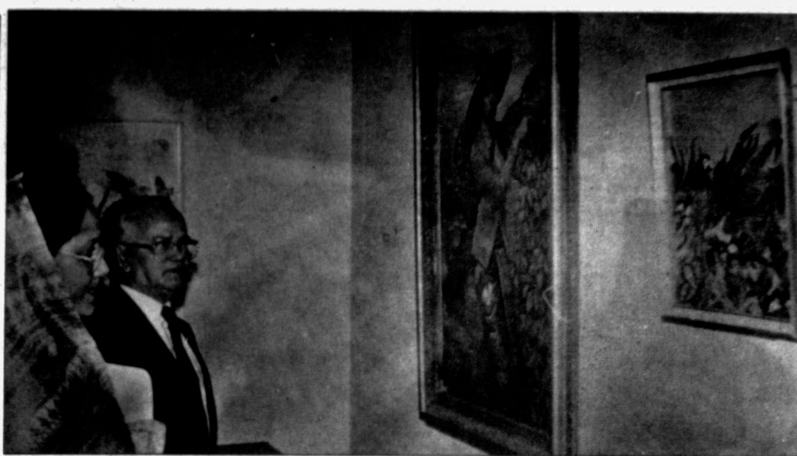
The month-long Fifth Asian Art Biennale was inaugurated by President Abdur Rahman Biswas at Osmany Memorial Hall on Friday. A total of works from 13 Asian countries will be put on display.

Meanwhile the law enforcement agencies took all precautionary measures against outbreak of communal incident, in the city. Special police contingents have been deployed in all the important places of the city.