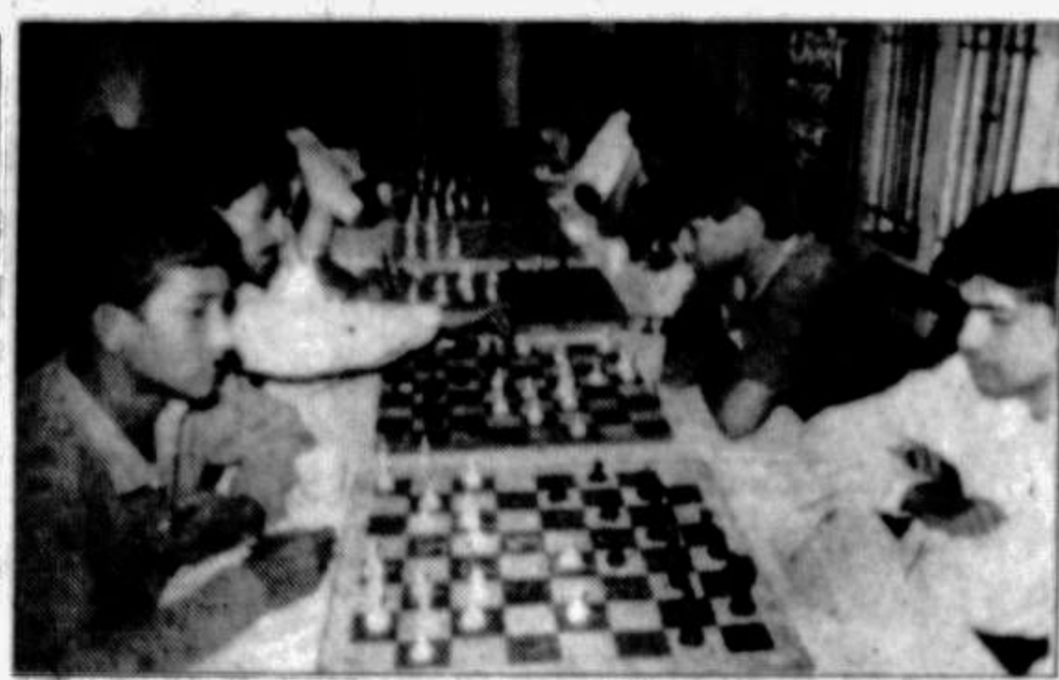
Fifth round matches of the Second Division chess league in progress yesterday at National Sports Council's chess room.