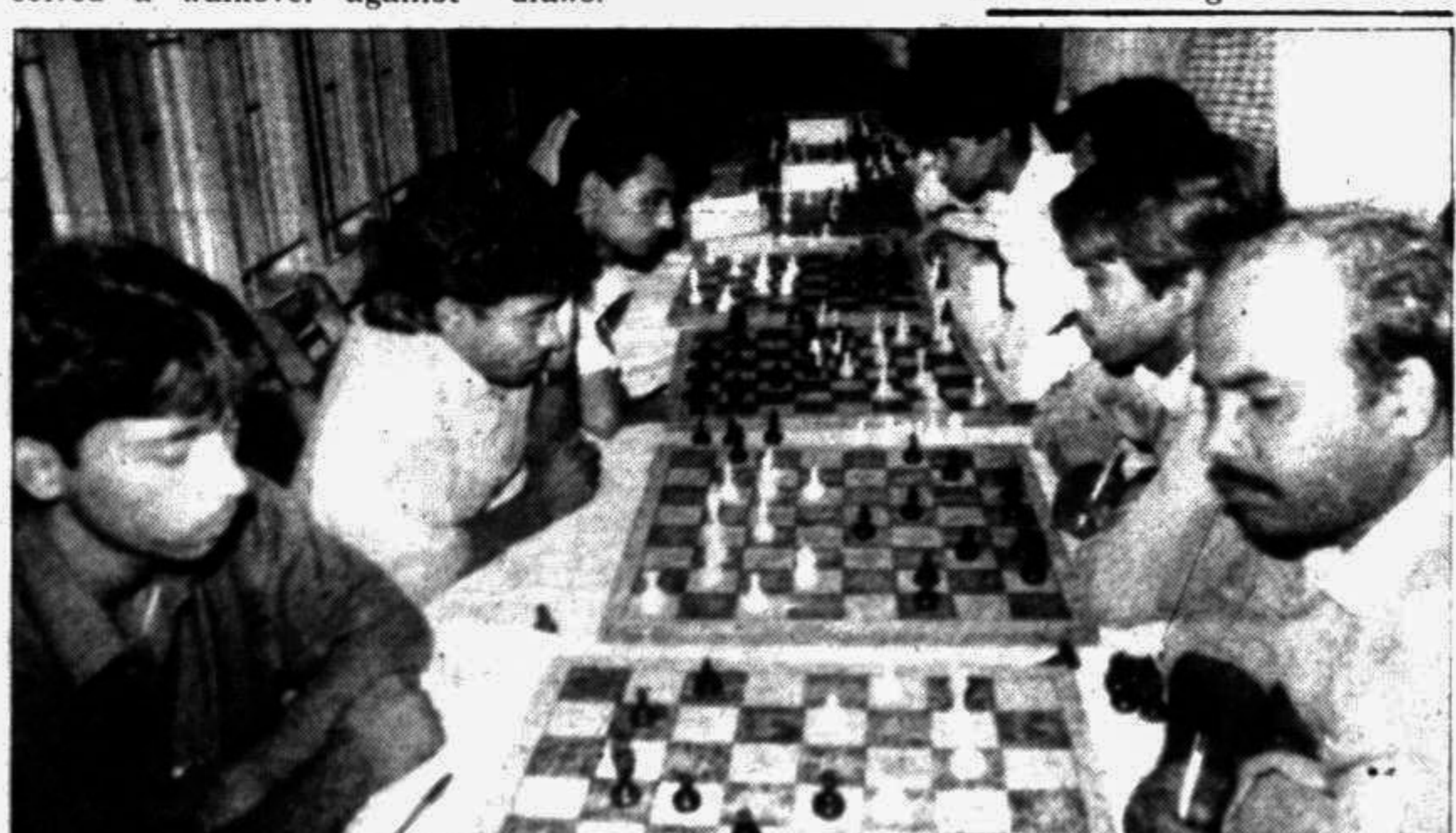
Participants ponder in pin-drop silence in team events of the Second Division chess league yesterday at National Sports Council's chess room.