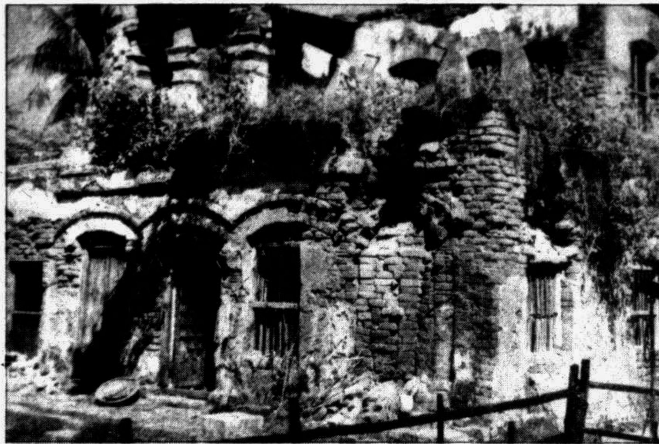
PABNA: This dilapidated century old private building at Gopalpur area may collapse at any moment.

Oct 28: Local fisheries department released one lakh fish fry under an open water fish fry scheme being executed in the current fiscal year, reports UNB. The fish fry have been released in the Noakhali khul at Begumganj upazila of the district. Official sources said villagers in five upazilas of the district were also being given loans amounting to over Tk. 87,000 to encourage fish cultivation in the privately owned ponds.