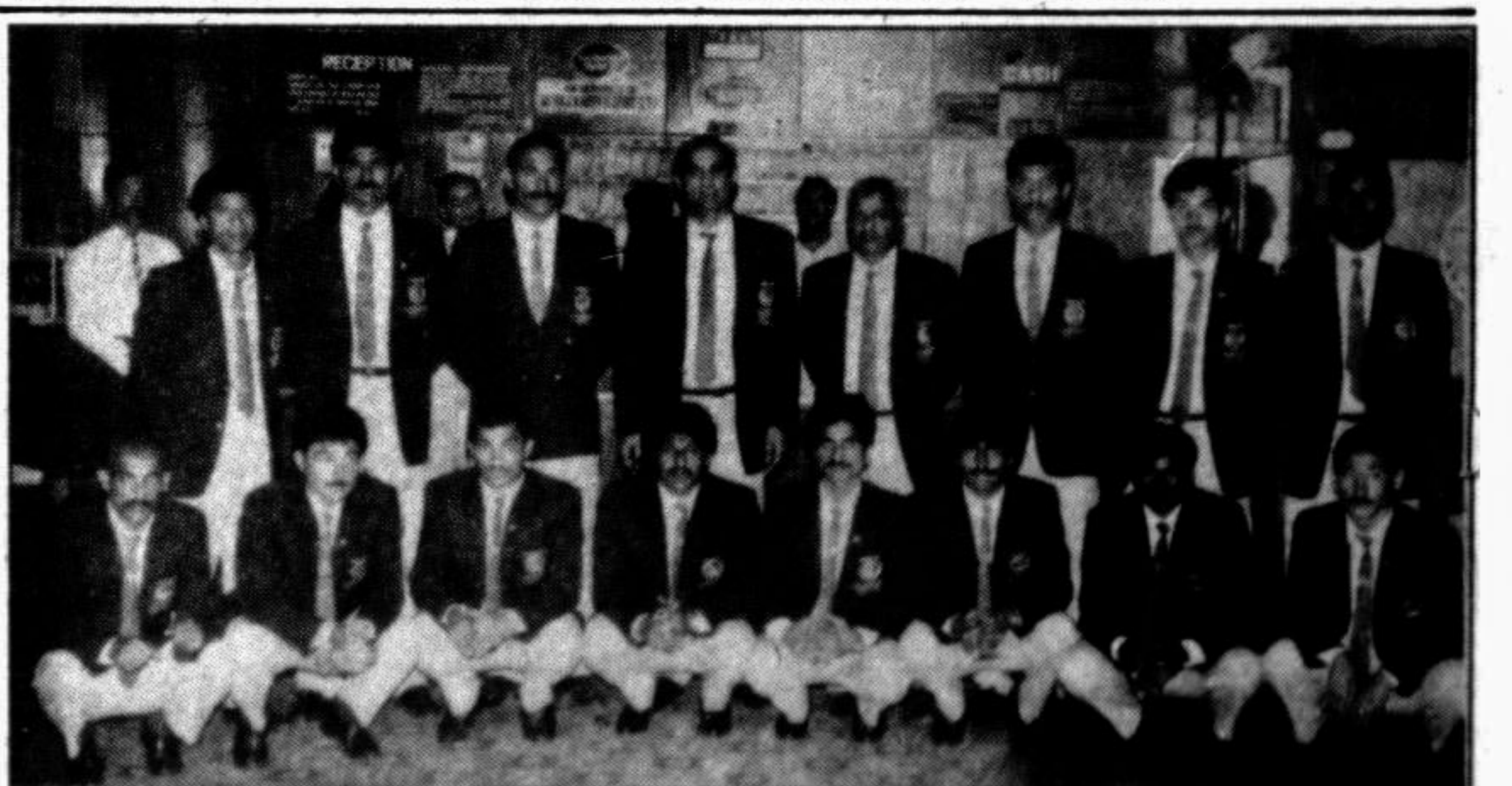
The Pakistan WAPDA football team arrived yesterday to play their qualifying first-leg match against Dhaka Mohammedans on Saturday.