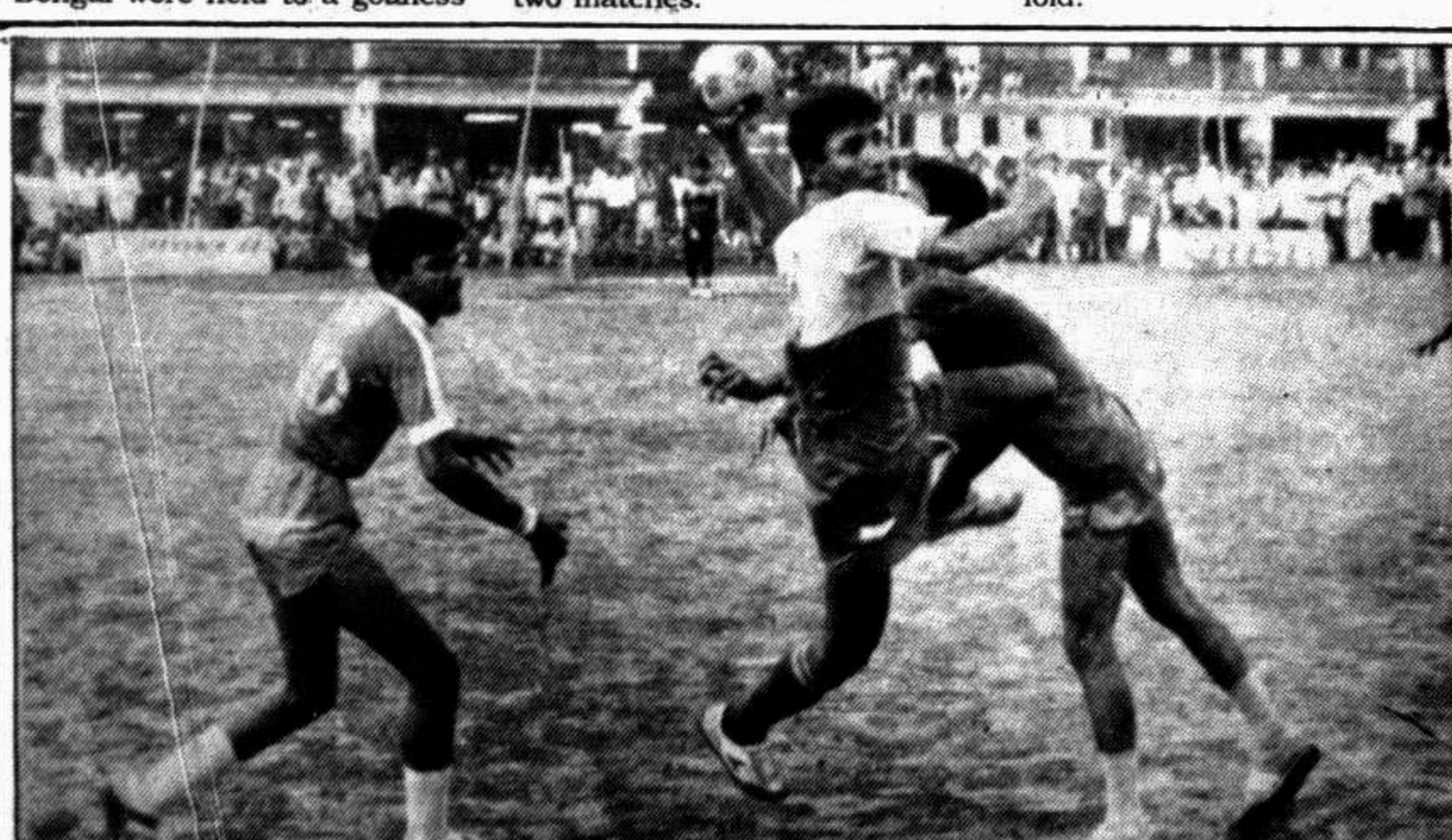
Action from yesterday's Bata handball semifinal match between Shaheed Nabi and KL Jubilee high schools at Outer Stadium handball court. Shaheed Nabi won 30-12.

draw by a spirited Bangladesh Army East Bengal finished second in the group with four points. Their only victory was over JCT (2-0). Bangladesh Army collected two points to move ahead of JCT who could muster only one point. From Group 'B' last year's runners-up Mahindra and Mahindra, Bombay, and Army XI have already booked the last-four places. However, the group position will be clear only after tomorrow's match between Mohun Bagan and Army XI. Mahindras have five points from three outings while Army team have garnered three from two matches.