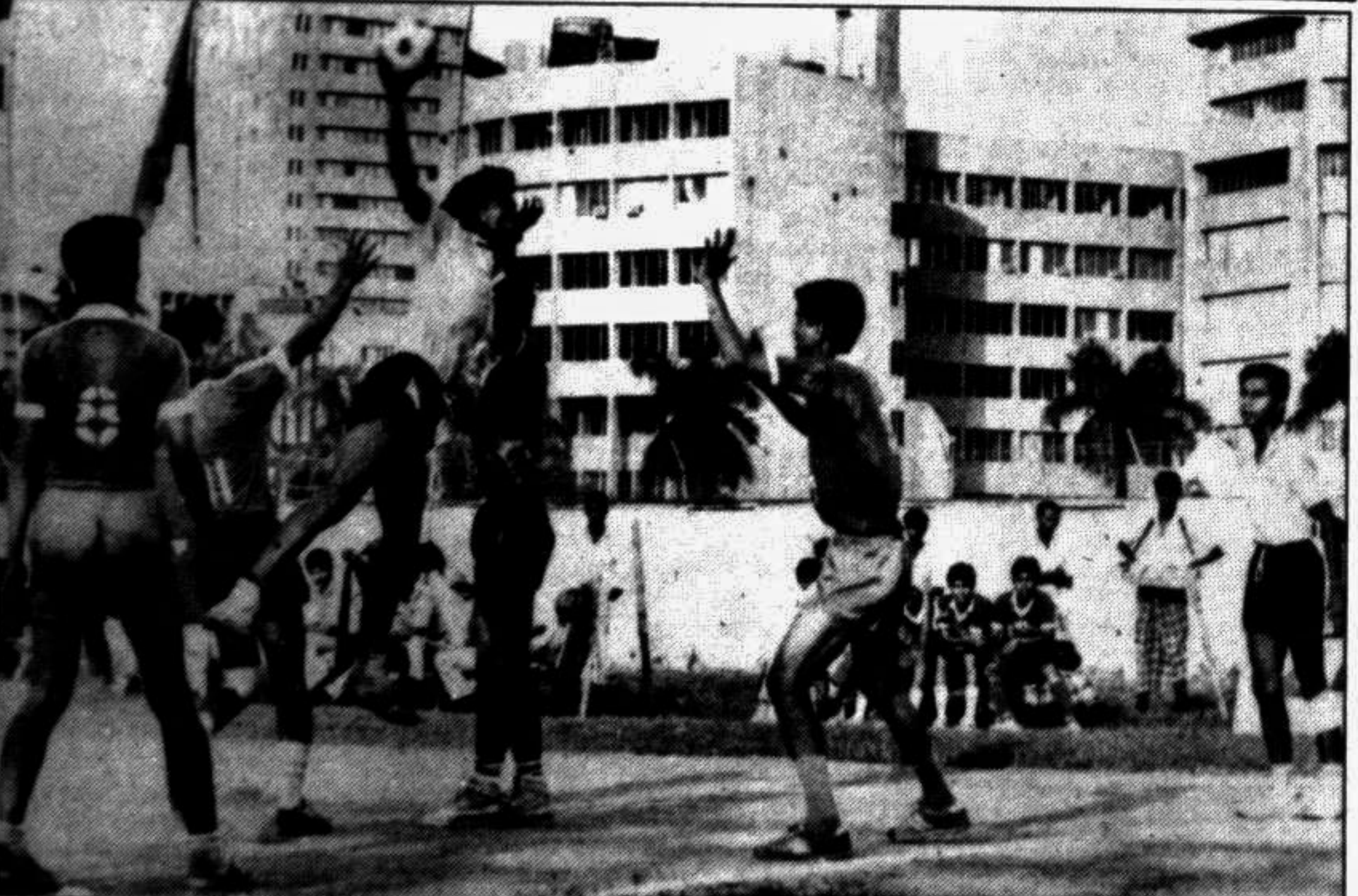
K L Jubilee High School defeated Rifles Public High School in the semifinal of the fourth Bata schools handball tournament at Outer Stadium handball court yesterday.