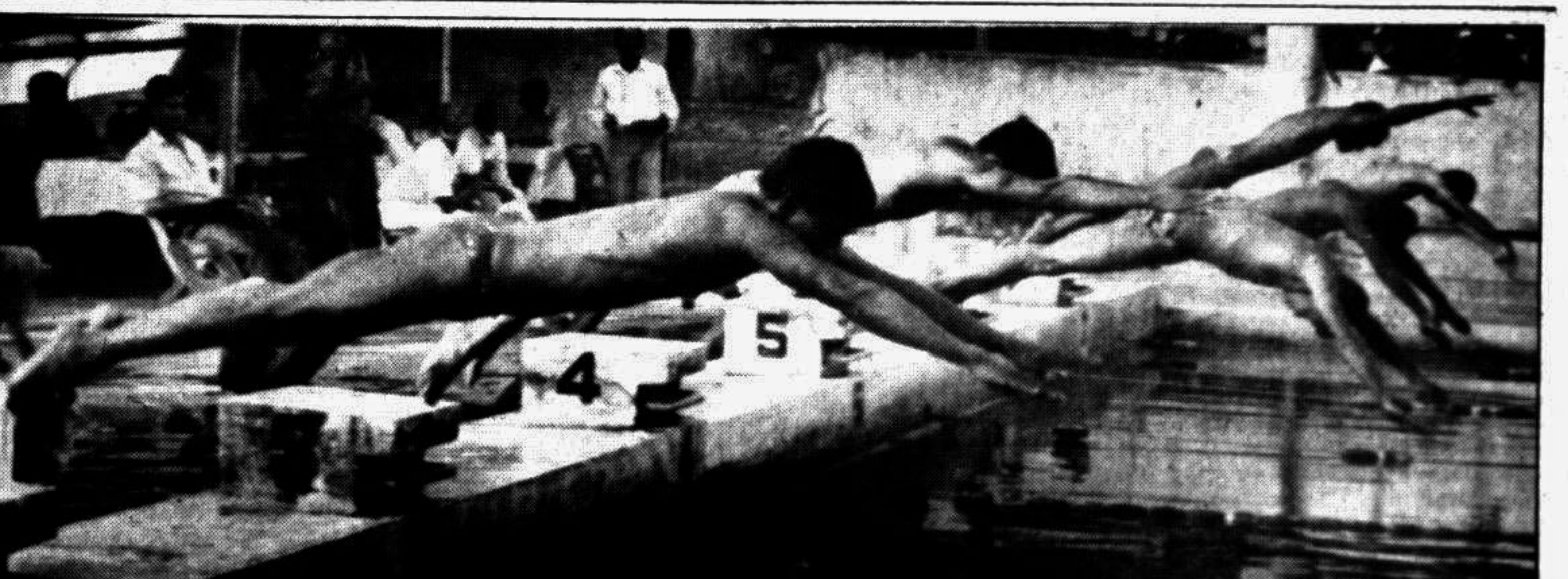
Start of the 200m individual medley for 13-14 year-olds in the national age-group swimming championships at the Dhaka Stadium swimming pool yesterday.