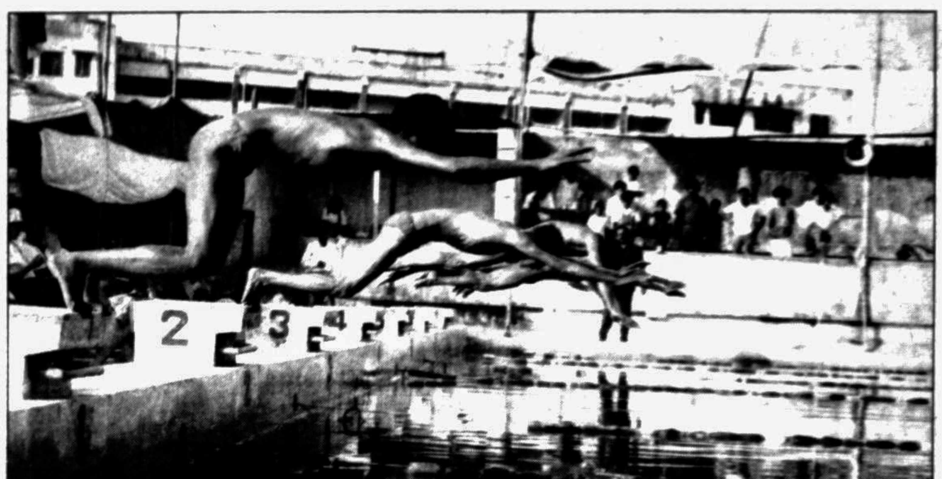
Start of the 200m breaststroke event for boys between 13-14 years on the opening day of the national age-group swimming championships at the Dhaka Stadium pool yesterday.