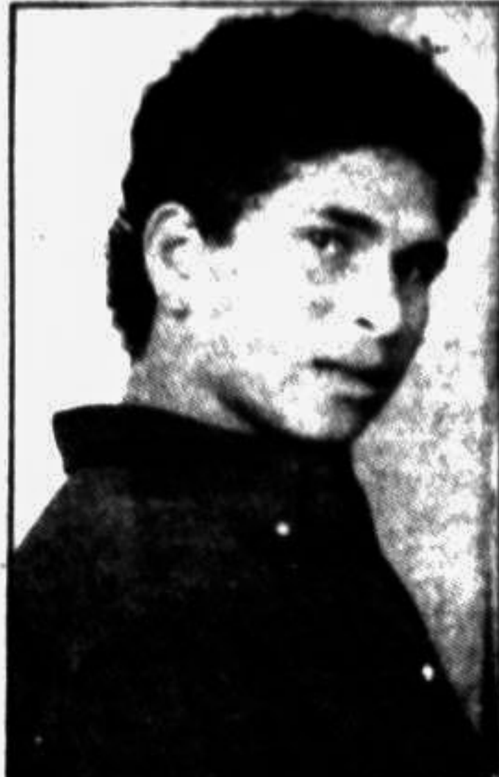
SACHIN TENDULKAR — the man of the match.

India were never in trouble reaching the modest victory target despite losing opener Woorkeri Raman, coming in