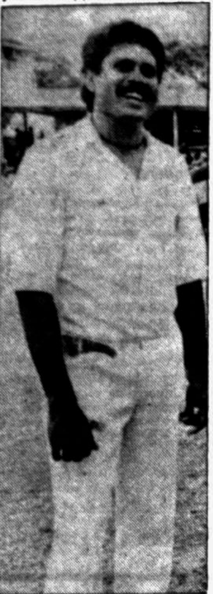
KAPIL DEV — 200 wickets

SHARJAH, United Arab Emirates, Oct 22: Indian all-rounder Kapil Dev claimed his 200th wicket in one-day cricket on Thursday, then declared his intention to claim a hundred more, reports AFP. The 32-year-old medium pacer trapped West Indian