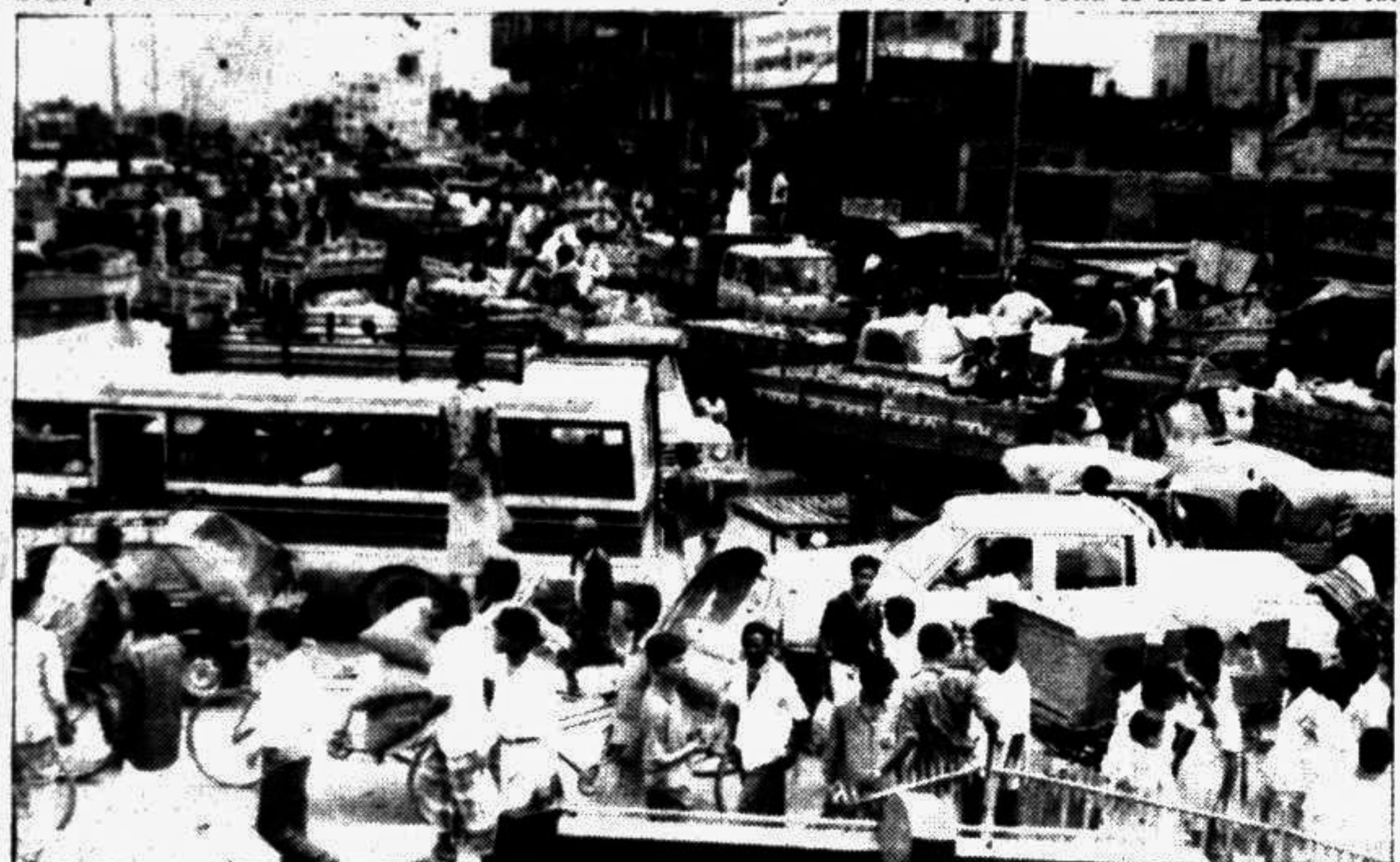
All jumbled up: Who goes first?

Tension starts! You tend to panic the moment you take the turning from your house on to the main road. Rickshaws, baby taxis or scooters (whatever one chooses to call them), the wayward minibuses and the private cars, all seem to be crumpling on to each other. You may be riding a rickshaw, or a jerky scooter, or even your own Toyota Corolla the tension is the same. On the other hand there are a number of people who are waiting to avail anyone of the public transport to reach their office.