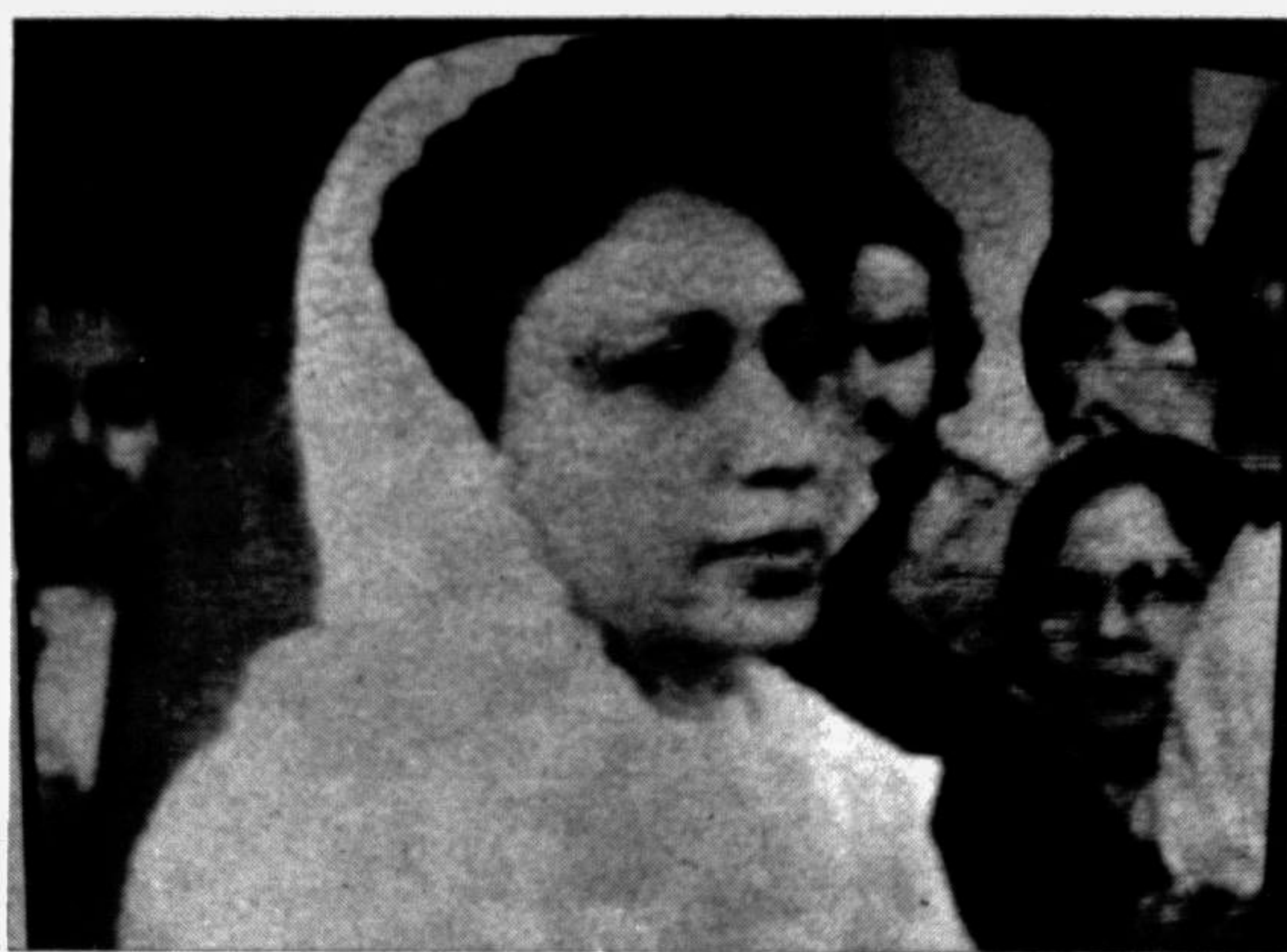
Prime Minister Begum Khaleda Zia on her way back home addressing BNP leaders and workers who gathered at the Gatewick airport to receive her on Saturday morning.

The team is also scheduled to visit Chittagong port and some cyclone-prone off-shore islands.