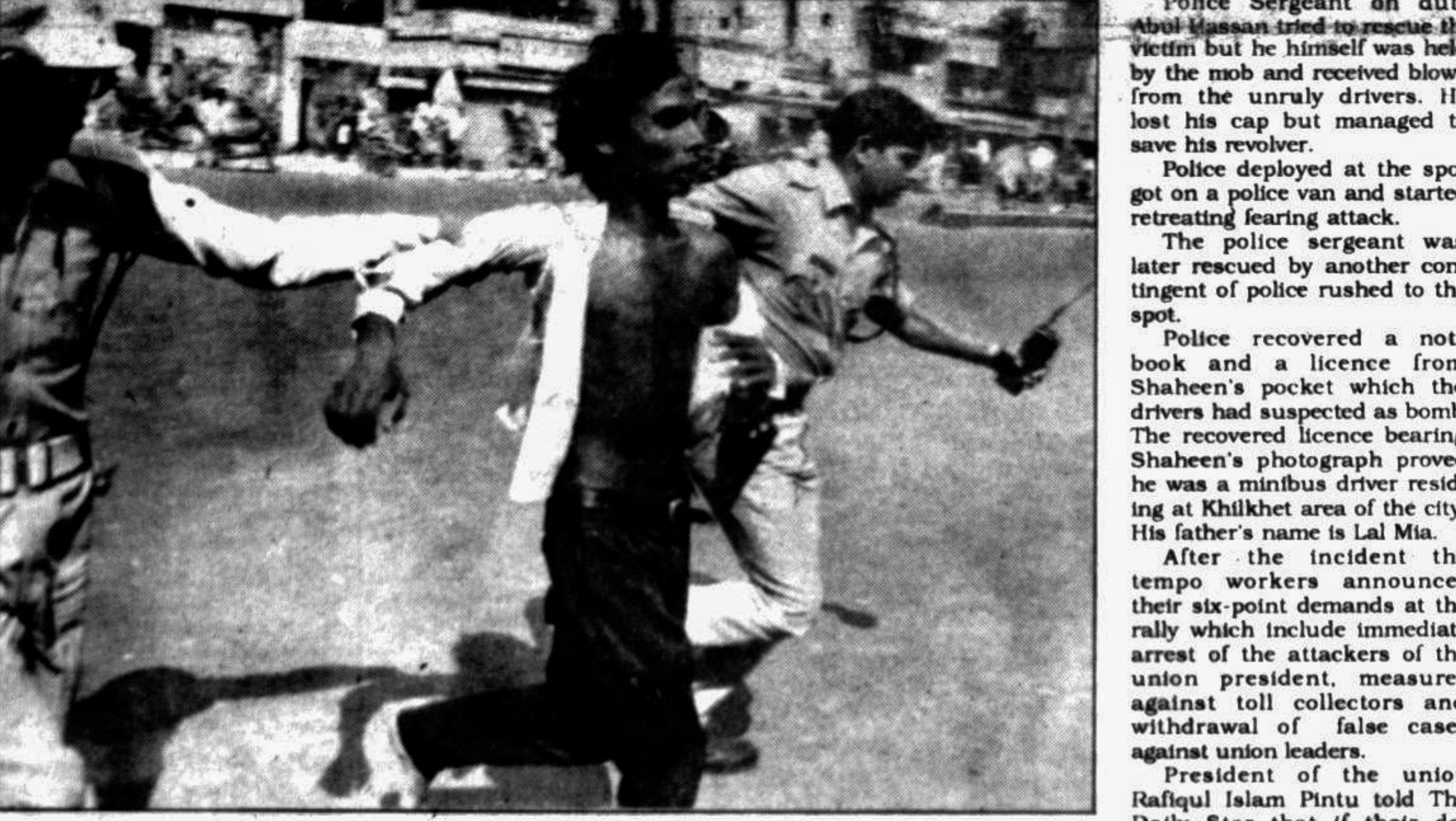
Top: Agitated auto-tempo drivers landing kicks and blows on a mini-bus driver (partially visible), who was rumoured to be a saboteur in their rally held in front of the National Press Club yesterday. Bottom: Policemen are rescuing the victim after mass beating.