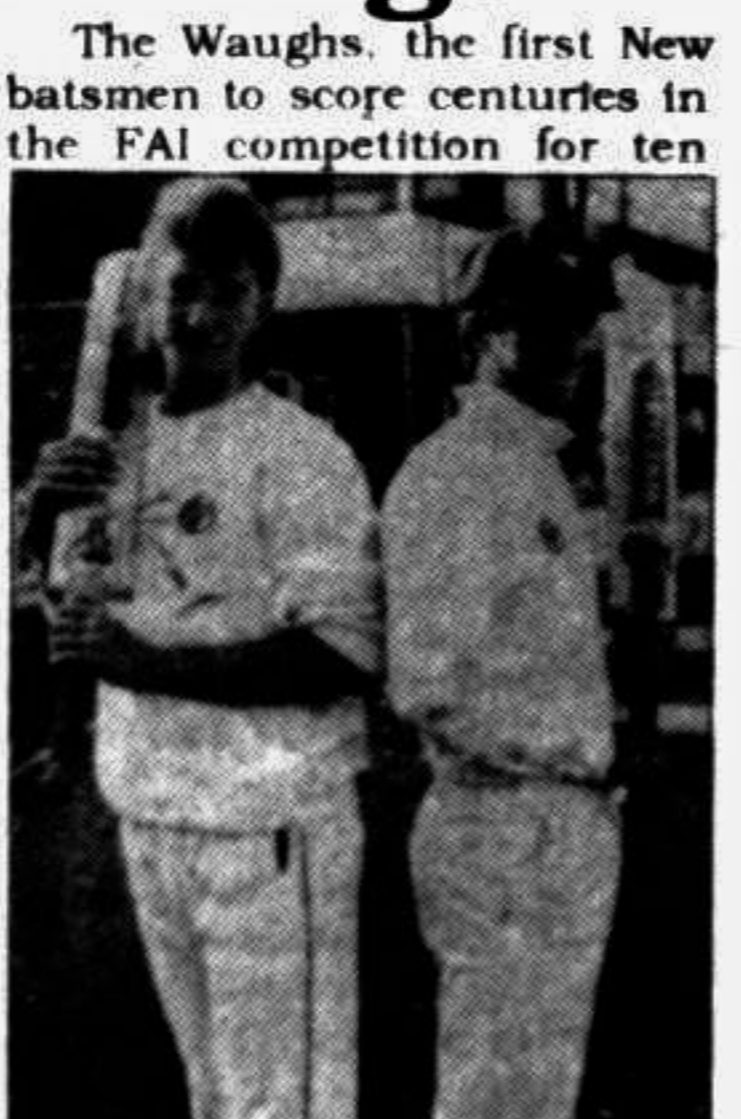
Mark (L) and Steve Waugh clipped the previous best partnership against Victoria 147 by Imran Khan, and John Dyson in Melbourne in 1984-85.