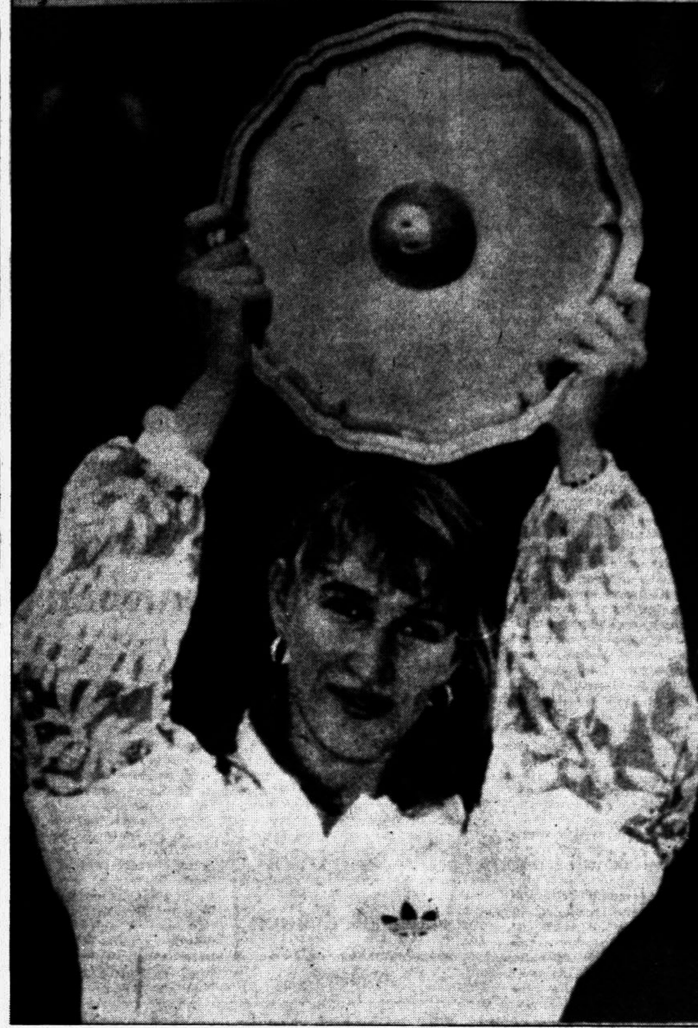
Steffi Graf of Germany lifts the European indoor tournament trophy after beating Nathalie Tauziat of France in the final 6-4, 6-4 in Zurich on Oct 13.

But to compensate their relatively weak bowling the Indians possess a very good batting line-up. Manjrekar, Tendulkar, Shastri, Prabhakar, Kapil Dev, Kiran More — are all capable of providing solidity in batting with their skipper Mohammed Azharuddin, after a brilliant summer-outing with Derbyshire, leading them from the front. In the opening slot Navjot Siddhu, Workeri