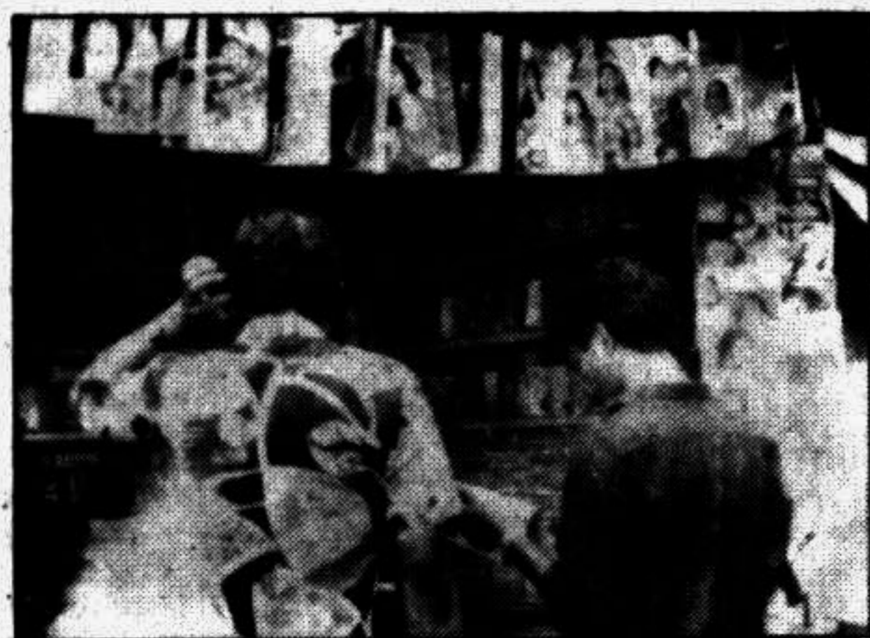
A book stall overflowing with new publications.

One of the major causes of the increase in the number of newspapers is perhaps heavy in-flow of cash into