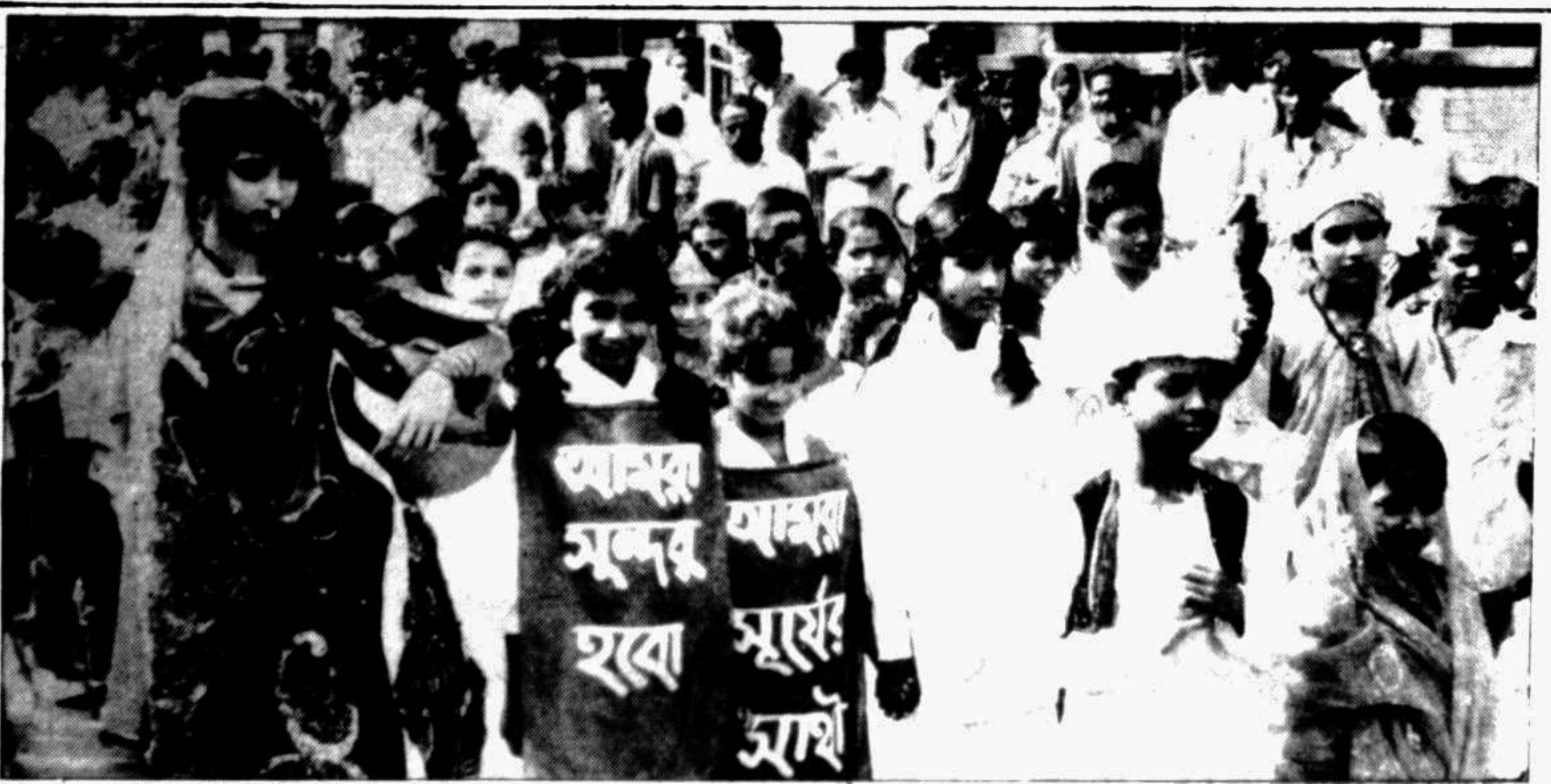
Members of the Chander Hat brought out a procession in observance of the International Children's Day in Narayanganj recently.