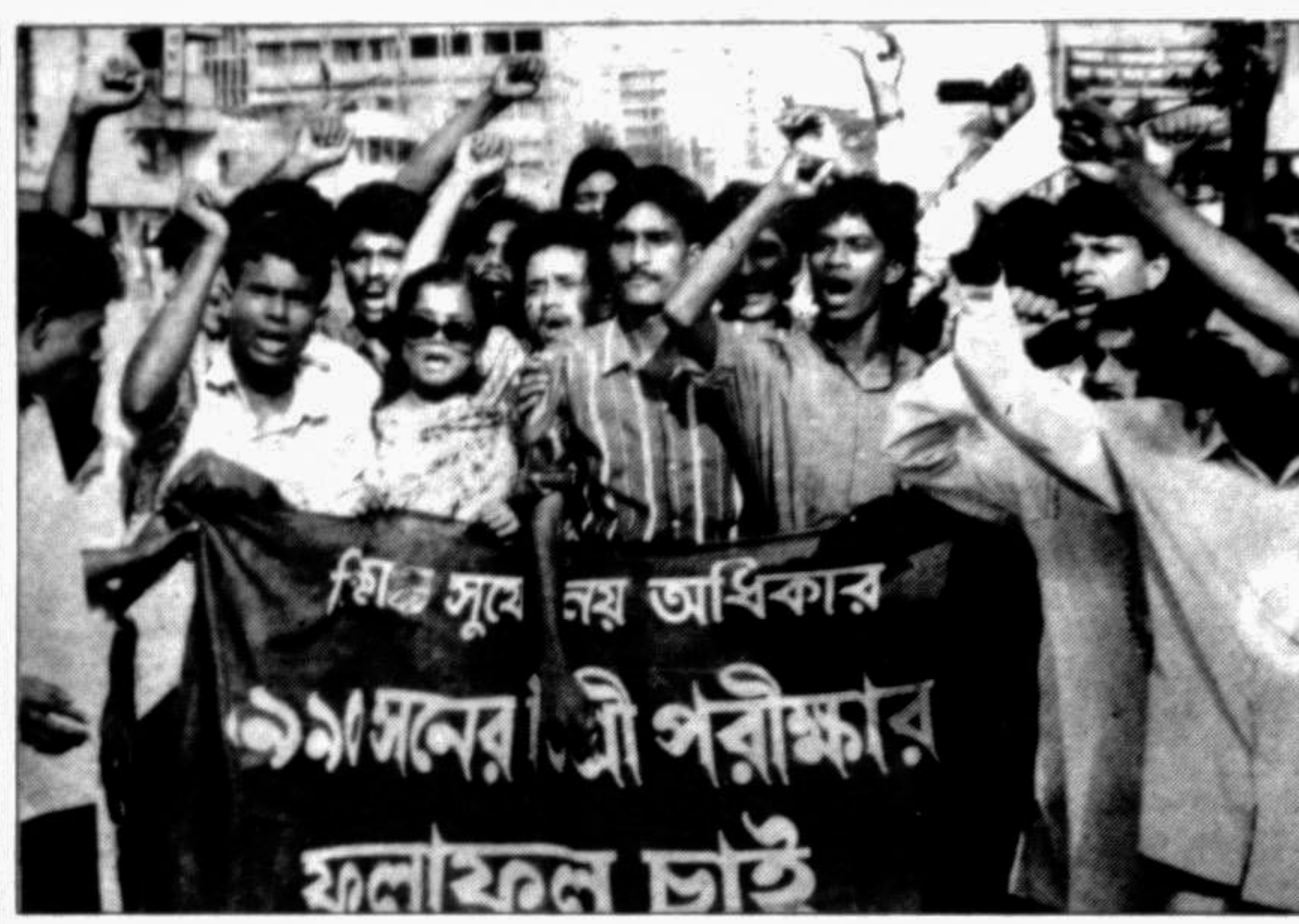
Students of Sirajganj College brought out a procession in the city Wednesday demanding publication of Degree Pass Examination results.