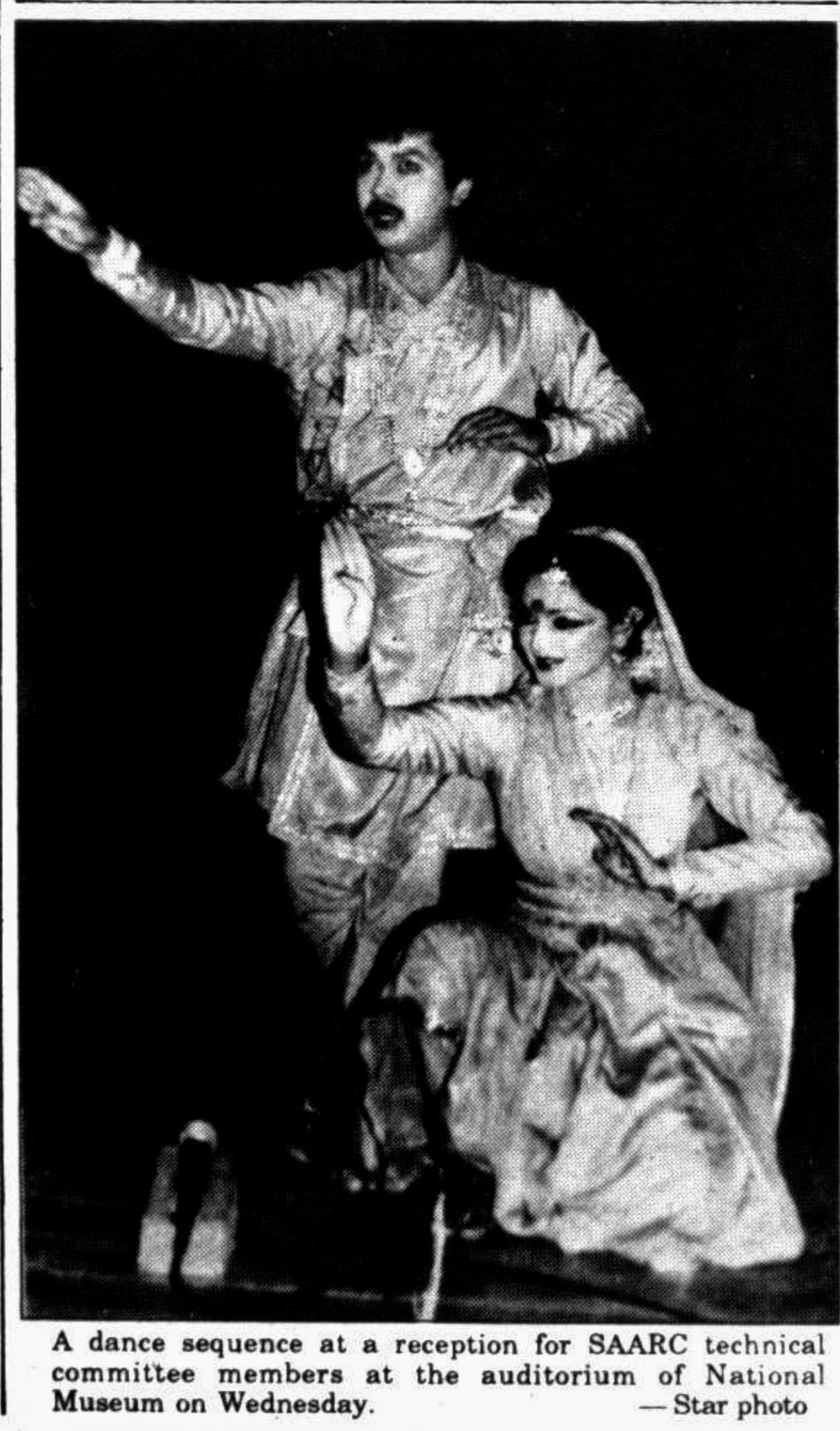
A dance sequence at a reception for SAARC technical committee members at the auditorium of National Museum on Wednesday.