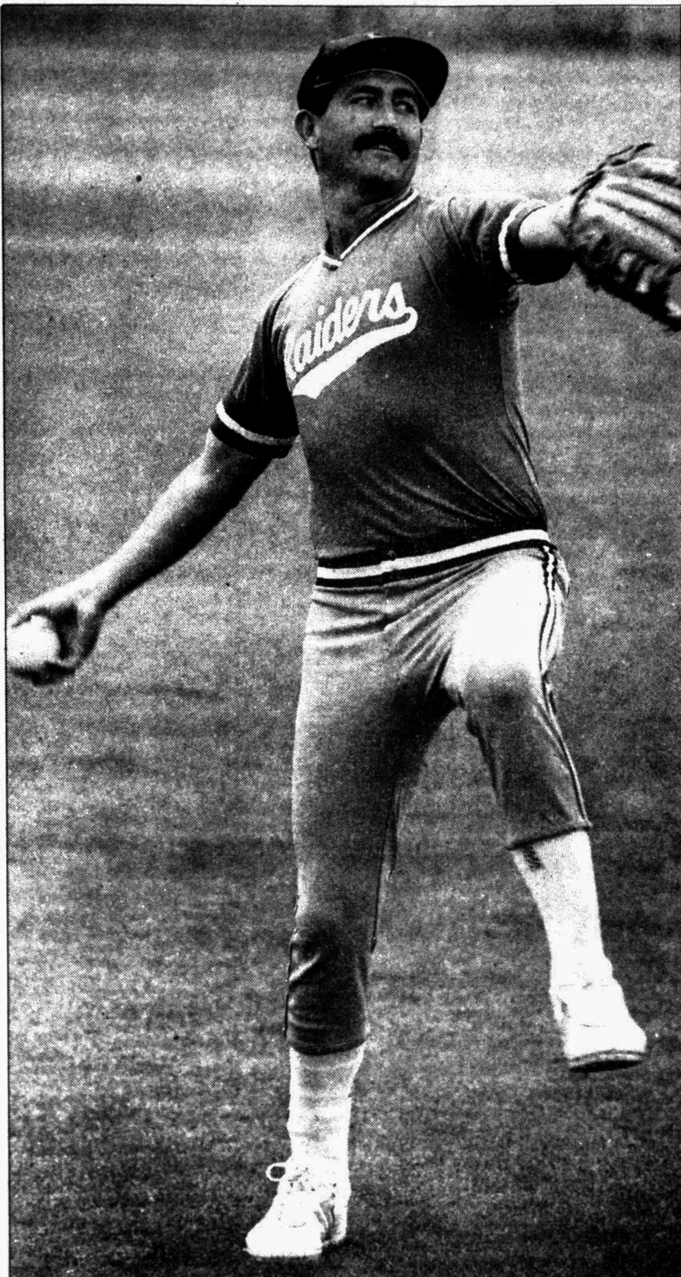
Making his pitch: England captain Graham Gooch swapped his cricket whites for a more American mode of dress as he helped to promote the fifth World Corporate Games — a festival of competitive sports — with a game of softball at Chelmsford, Essex late last month.

Chiburdanidze (white) Xie (black) 1. E4 25 2. NF3 NC6 3. BB5 A6 4. BA4 NF6 5. O-O BE7 6. BXC6 DXC6 7. D3 ND7 8. B3 O-O 9. BB2 F6 10. NC3 NC5 11. NE2 RF7 12. NH4 NE6 13. NF5 BF8 14. QD2 C5 15. F4 NXF4 16. NXF4 EXF5 17. EXF5 QD6 18. QXF4 QXF4 19. RAE1 QXF4 20. RXF4 RE7 21. RFE4 KF7 22. KF2 RD8 23. KF3 O6 24. FXC6 Draw