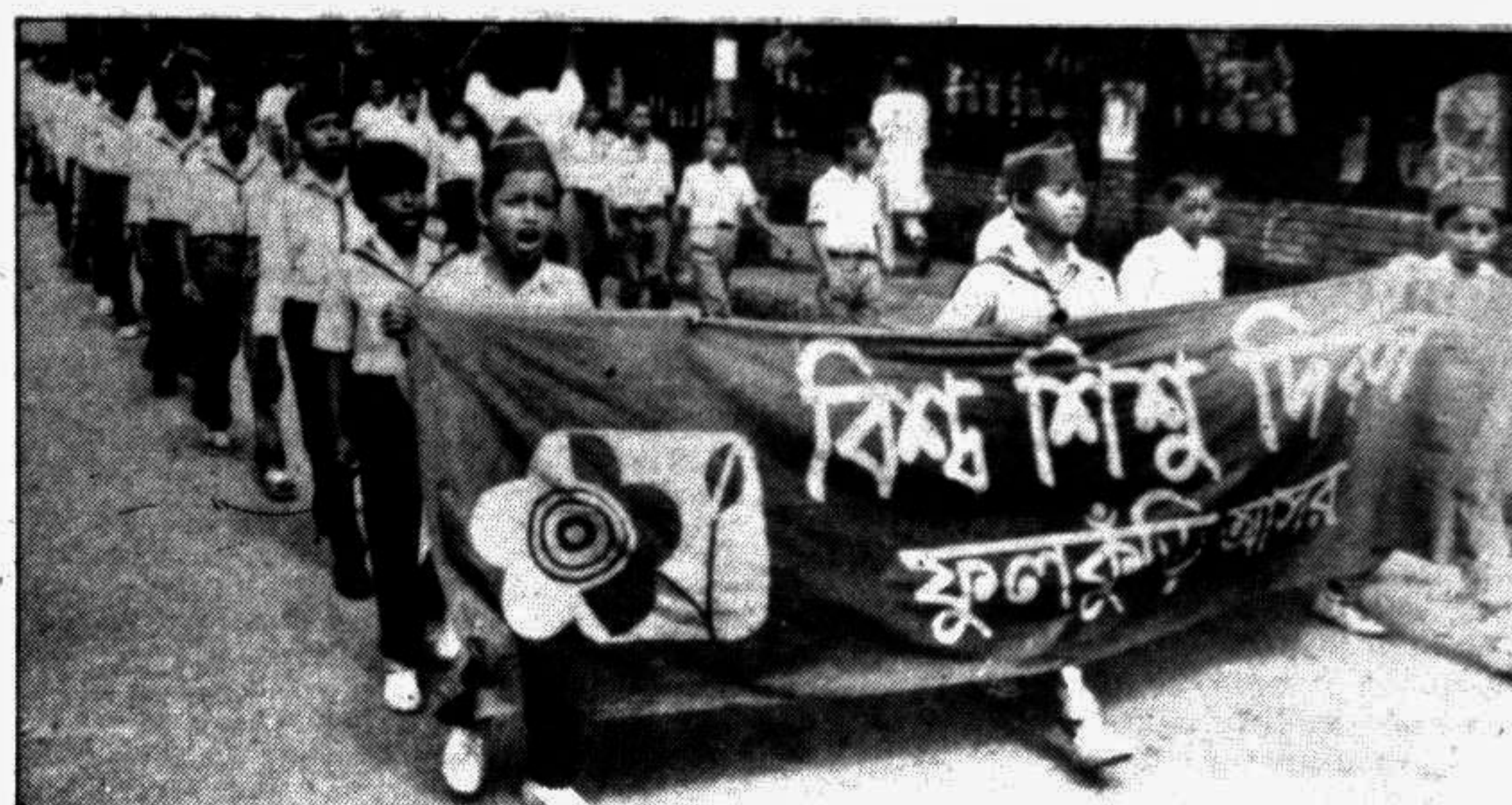
School children holding a colourful rally in city Monday in observance of Universal Children's Day.