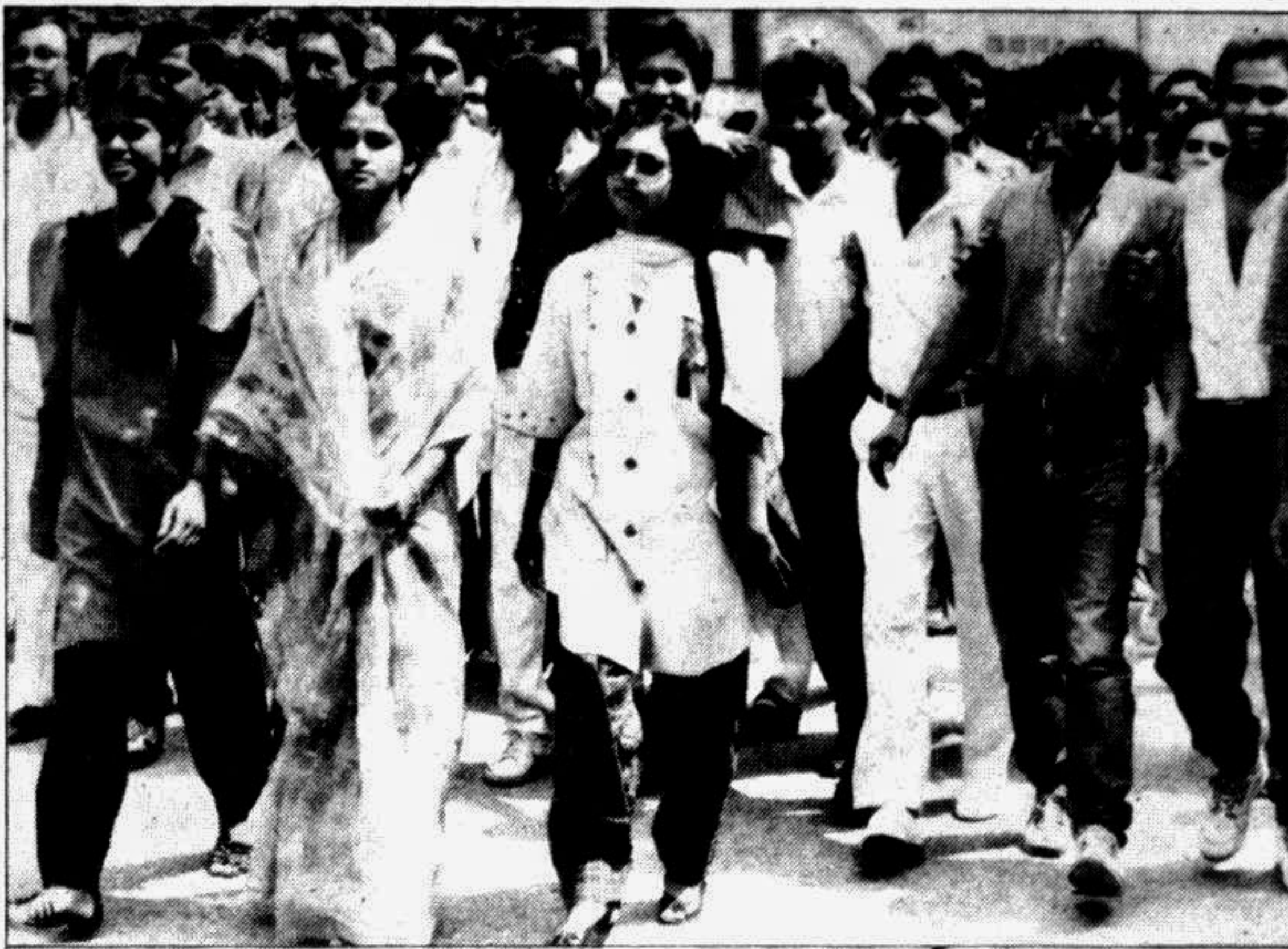
Chhatra League's procession Wednesday demanding terrorism-free campus.