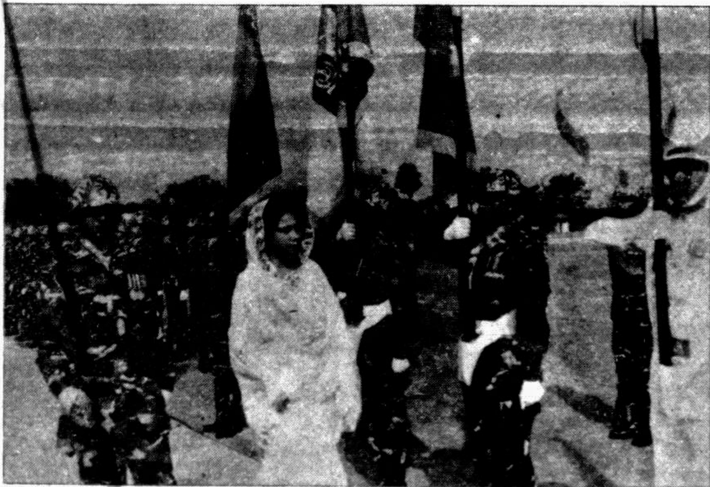
Prime Minister Begum Khaleda Zia reviewing a ceremonial guard of honour by smartly turned-out contingents of the three services at the Old Airport Sunday.