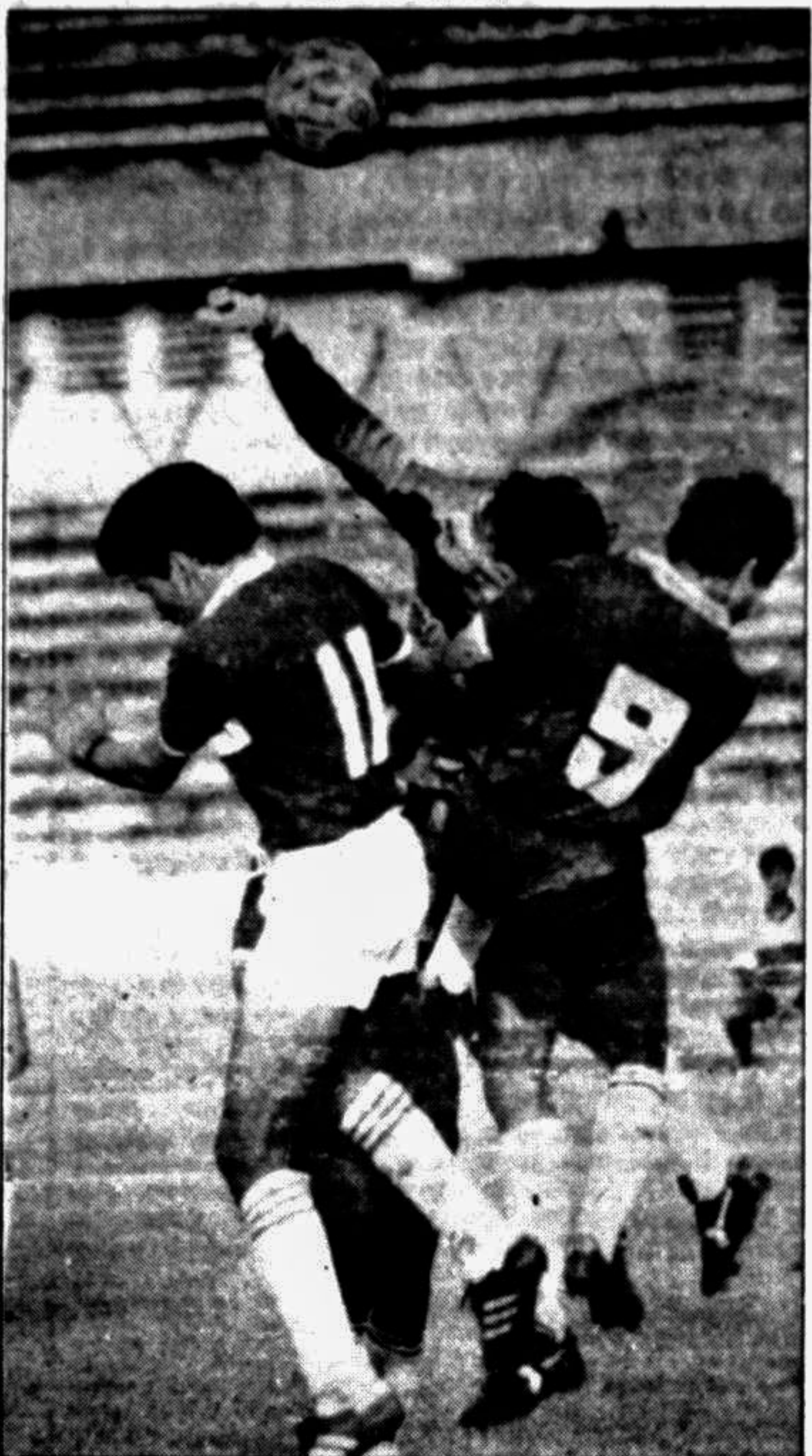
Action from yesterday's Federation Cup football match at the Dhaka Stadium between Eskaton Sabuj Sangha and Agrani Bank. The Bankers won 3-2 on penalties after the regulation period ended goalless.

Dhaka Wanderers Club and Agrani Bank won their respective matches with the help of tie-breakers in the eleventh Federation Cup football tournament yesterday at Dhaka Stadium.