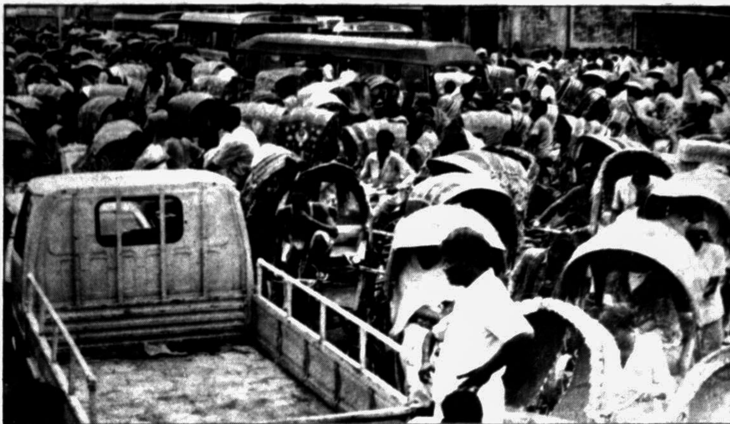
Traffic jam is now a regular feature in Dhaka city. The authorities concerned are yet to devise ways to stem the rot, much to the agonies of city-dwellers.