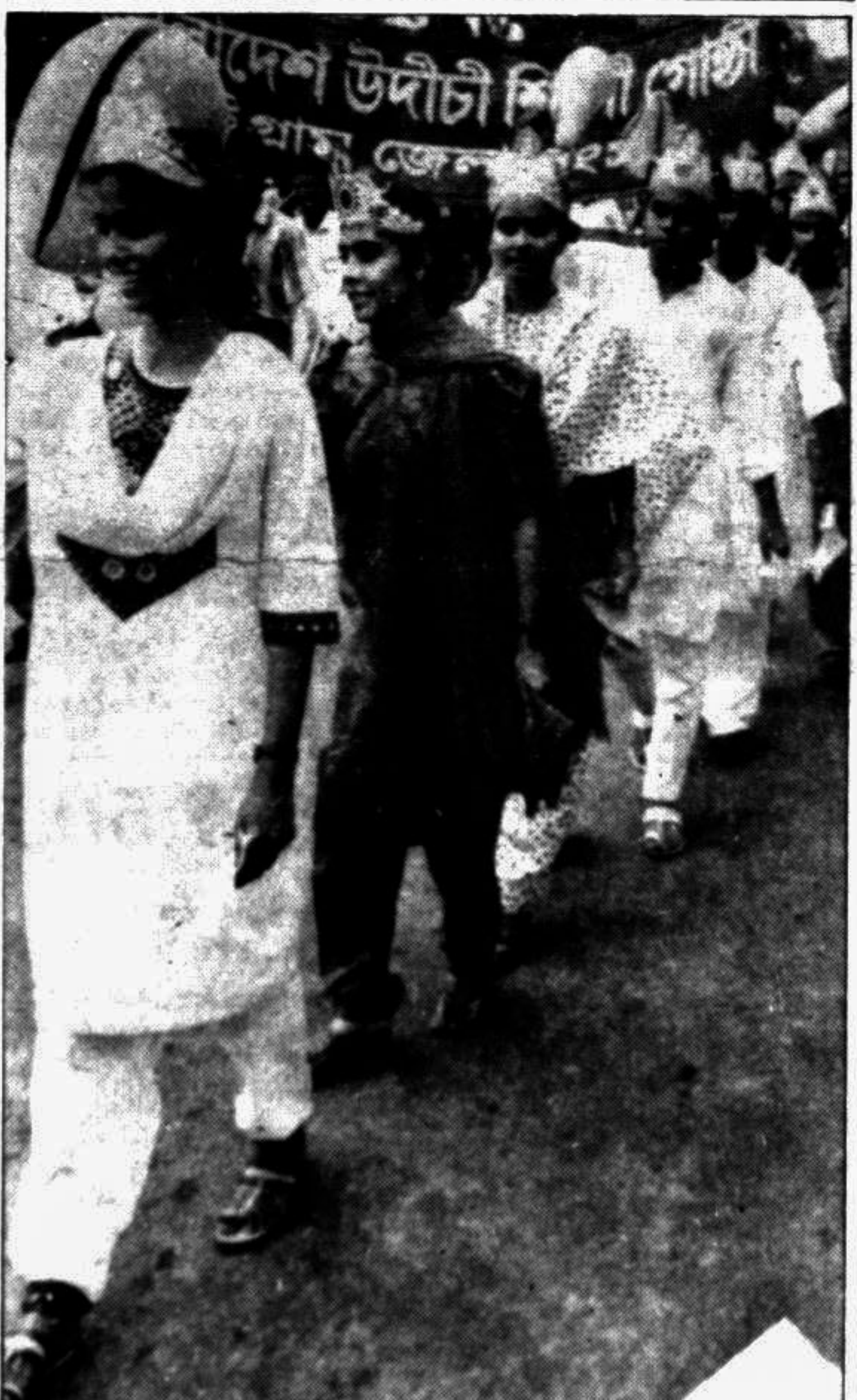
Members of the 'Udichi', a cultural organisation, brought at a colourful procession in the city on Saturday marking its annual conference.

A ranking CPB leader was of the opinion that the approaches employed by major parties were not conducive to the putting up of a consensus candidate in the presidential election. Their methods were See Page 12 Col. 6