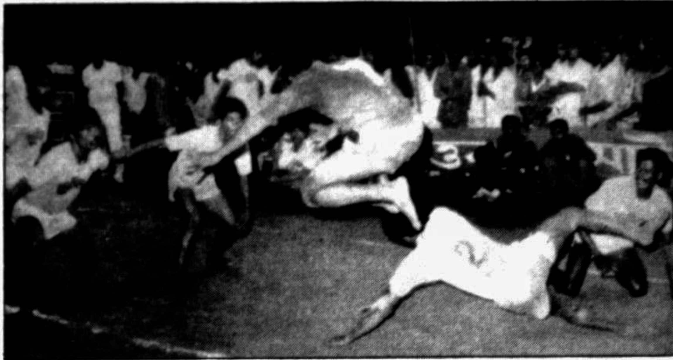
The national kabaddi final round match between Ansars and Comilla in progress yesterday at Outer Stadium kabaddi court. Ansars won 40-10 in move into the semifinals.

divisional teams — are taking part in the first round, split into four groups. The Group 'A' comprises BRIC SC, Dhanmodi Club, Sadharan Bima, KS, Wari Club and Rajshahi Division. Dhaka Wanderers, Arambagh KS Agrani Bank, Bangladesh PWD SC and Eskaton Sabuj Sangha are placed in Group 'B'. In Group 'C' are Youngmen's Club of Fakirerpool, Rahmatganj MFS, Victoria Sporting Club, Adamjee SCC and Khulna Division. The national champions Bangladesh Army, Farashganj SC, BJMC SC, Police AC and Dhaka division make up Group 'D'. The Group champions will