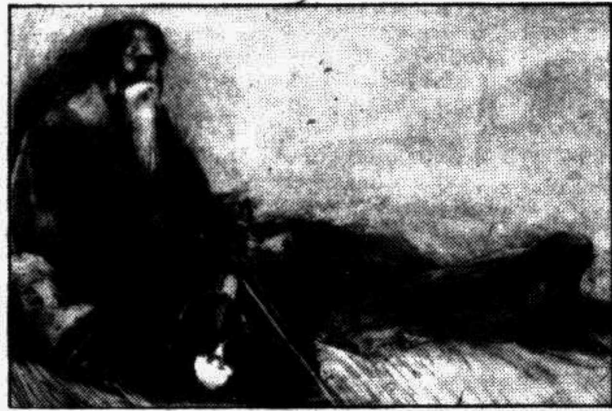
Old Man with Sharinda