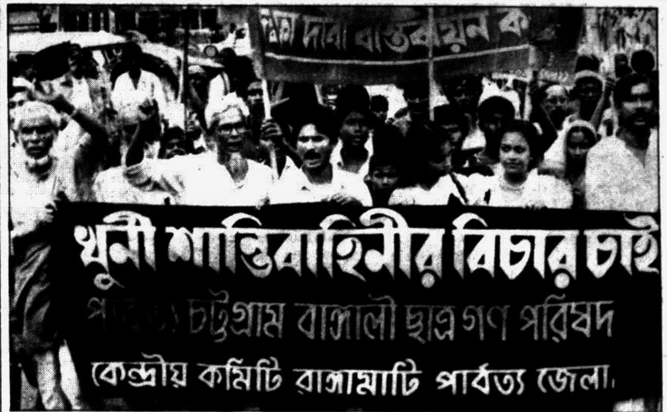
Parbatta Chhatragram Bangalee Chhatra-Gana Parishad holding a rally in the city Wednesday demanding trial of the members of Shantibahini for subversive activities.

Met office on Wednesday forecast rain or thundershower with temporary gusty wind and a few moderately heavy falls may occur at most places over Chittagong and Rajshahi Divisions and at many places over Dhaka and Khulna Divisions during the next 24 hours commencing 6 pm Wednesday. Day temperature may fall by one to four degree Celsius. Rajshahi experienced the highest rainfall 147 mm in 12 hours on Wednesday while it was 72 mm at Tangail, 62 mm at Feni, 35 mm each at Chittagong, Sylhet and Bhola, 58 mm at Srirangal, 39 mm at Patuakhali, 23 mm at Sandwip, and 14 mm at Dhaka. Sun set at Dhaka on Thursday at 5-52 pm and sunrise Friday at 5-49 am. Temperature and humidity recorded at important cities and towns on Wednesday were: Cities/Towns Temperature in Celsius Humidity in percentage Max Min 9 am 6 pm Dhaka 28.5 24.6 95 88 Chittagong 29.0 23.8 86 92 Rajshahi 31.2 23.6 89 100 Khulna 28.5 24.6 98 93 Dinajpur 31.4 24.5 87 95 Bogra 30.4 23.9 99 99 Barisal 28.0 23.8 100 95 Feni 27.3 22.8 97 100 Sylhet 25.2 22.0 97 98