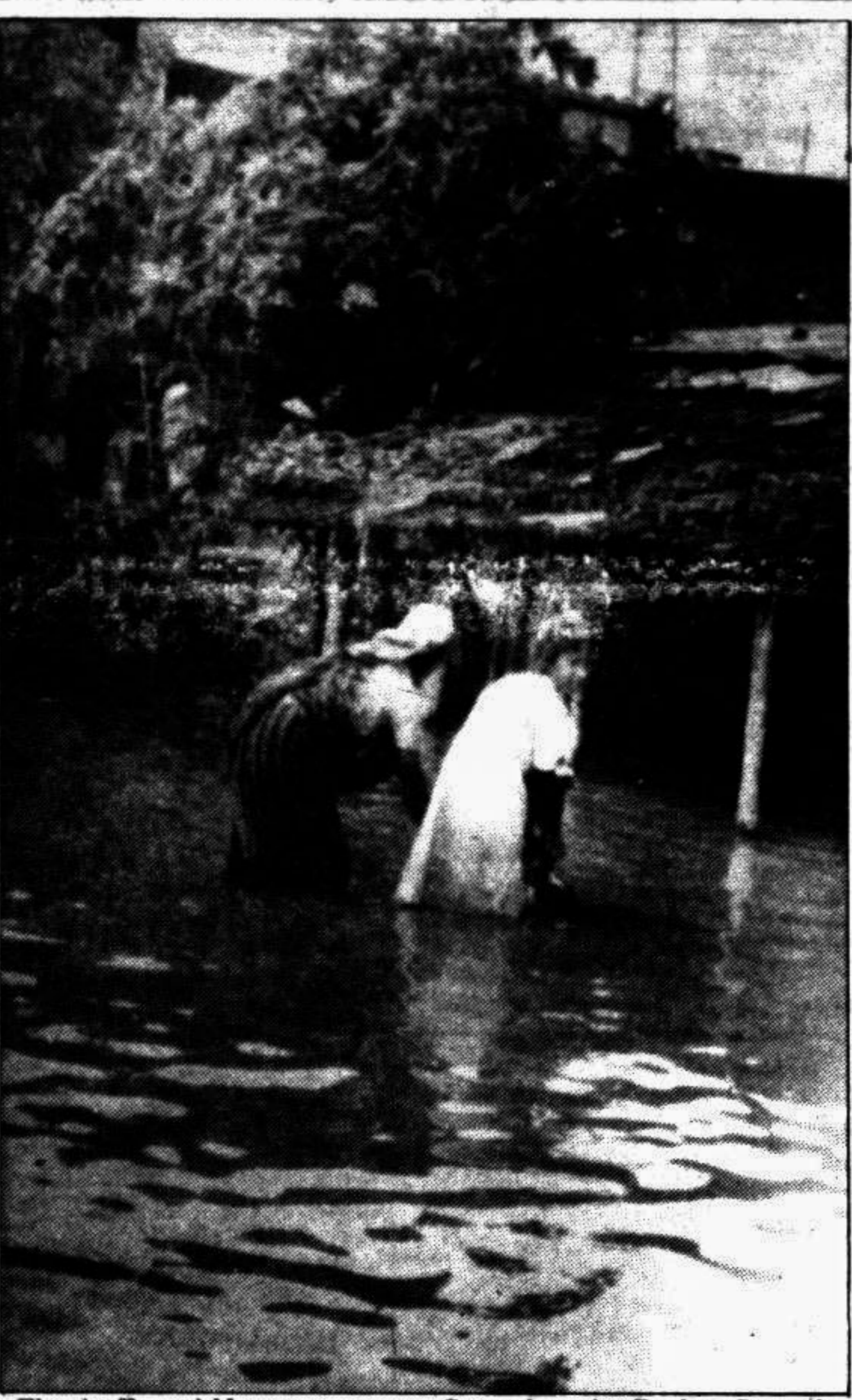
Flood affected Noagaon town

A central leader of the party told the Daily Star that AL was observing BNP's move and a final decision would be taken this morning. The AL leader said that his party was not approached by BNP till last night for reaching a consensus for nominating a single candidate for the post of President.