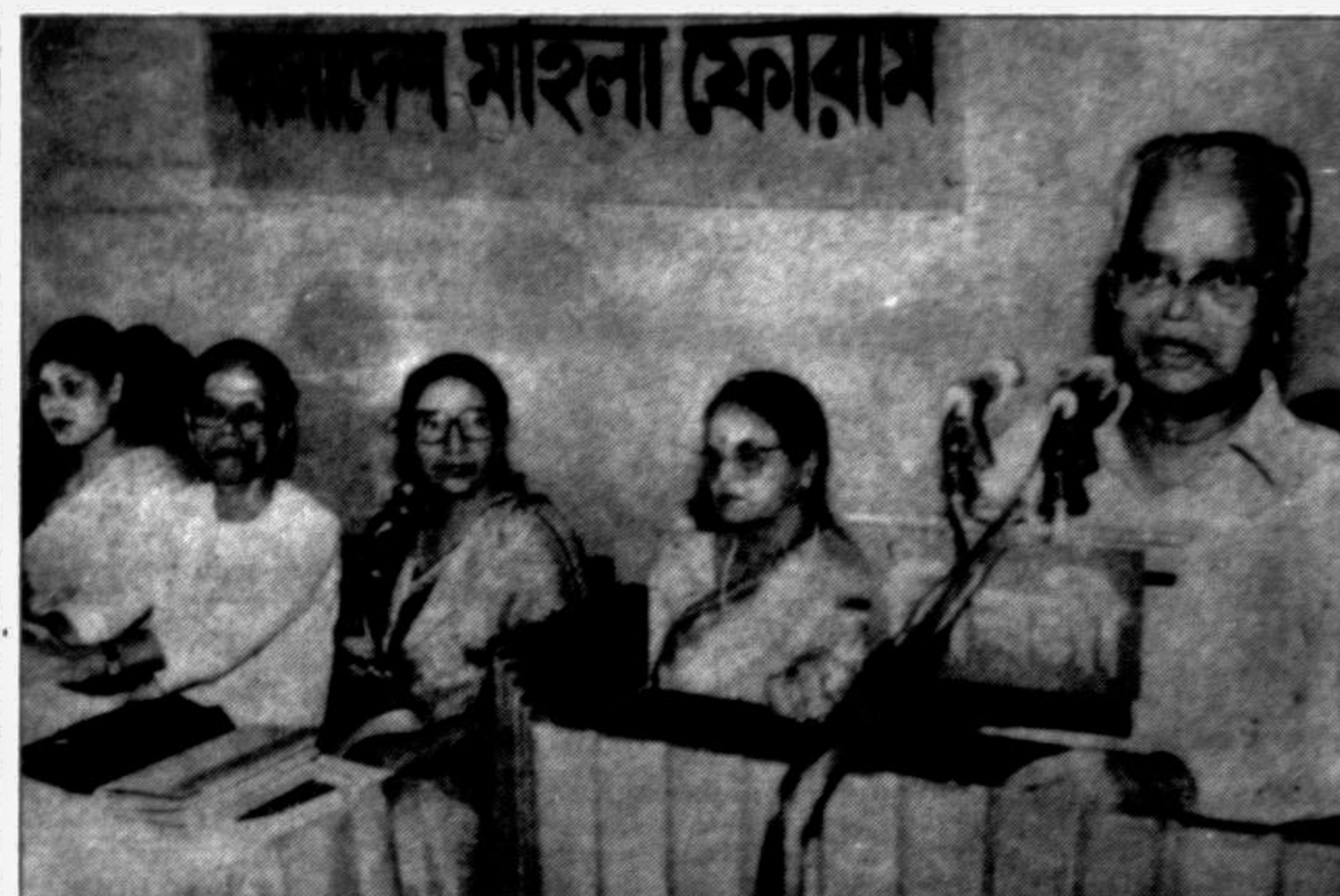
Speaker Abdur Rahman Biswas addressing a discussion meeting in observance of the first founding anniversary of Bangladesh Mahila Forum at the National Press Club on Friday.