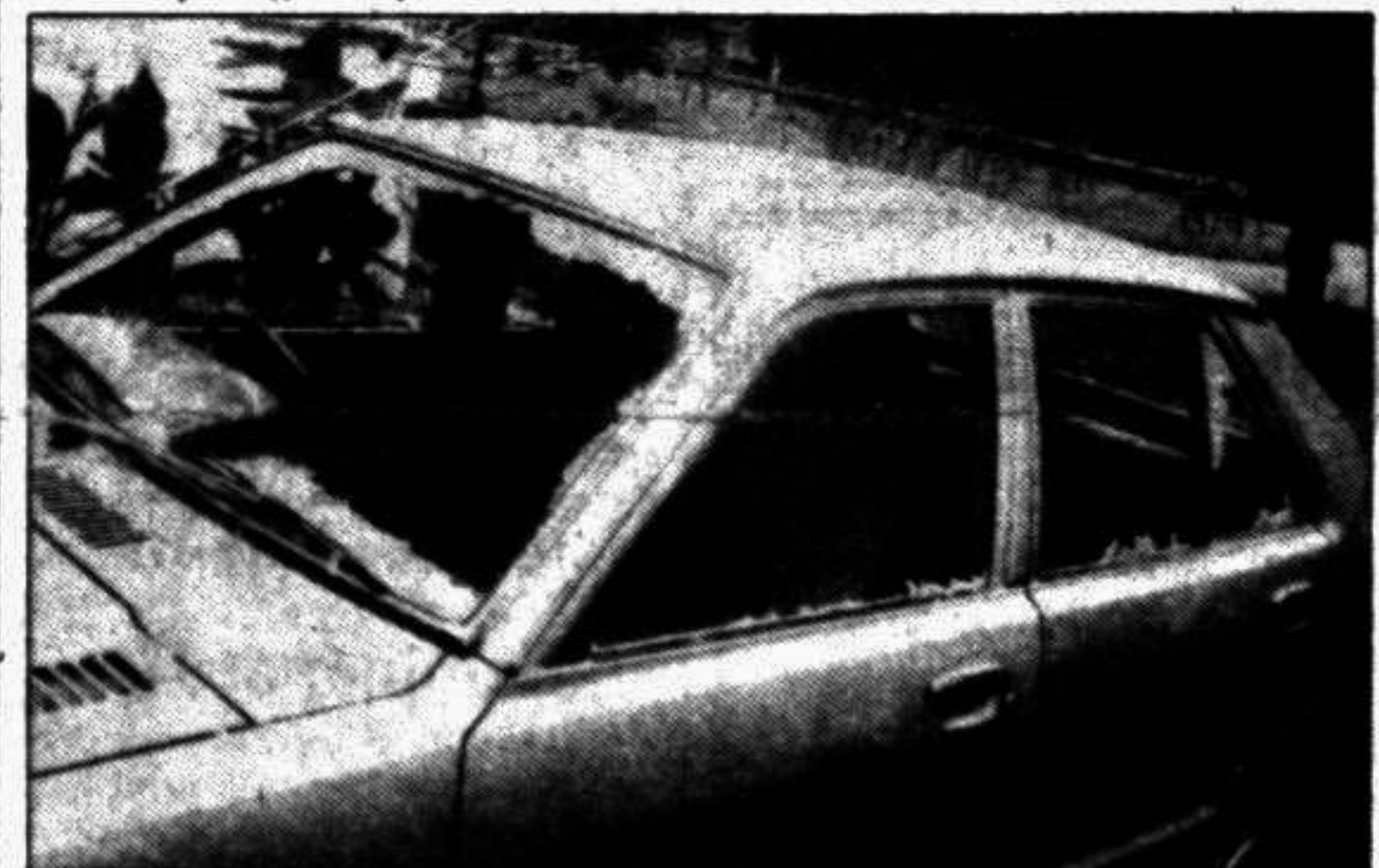
One of the two cars damaged in front of the Vice-Chancellor's residence.