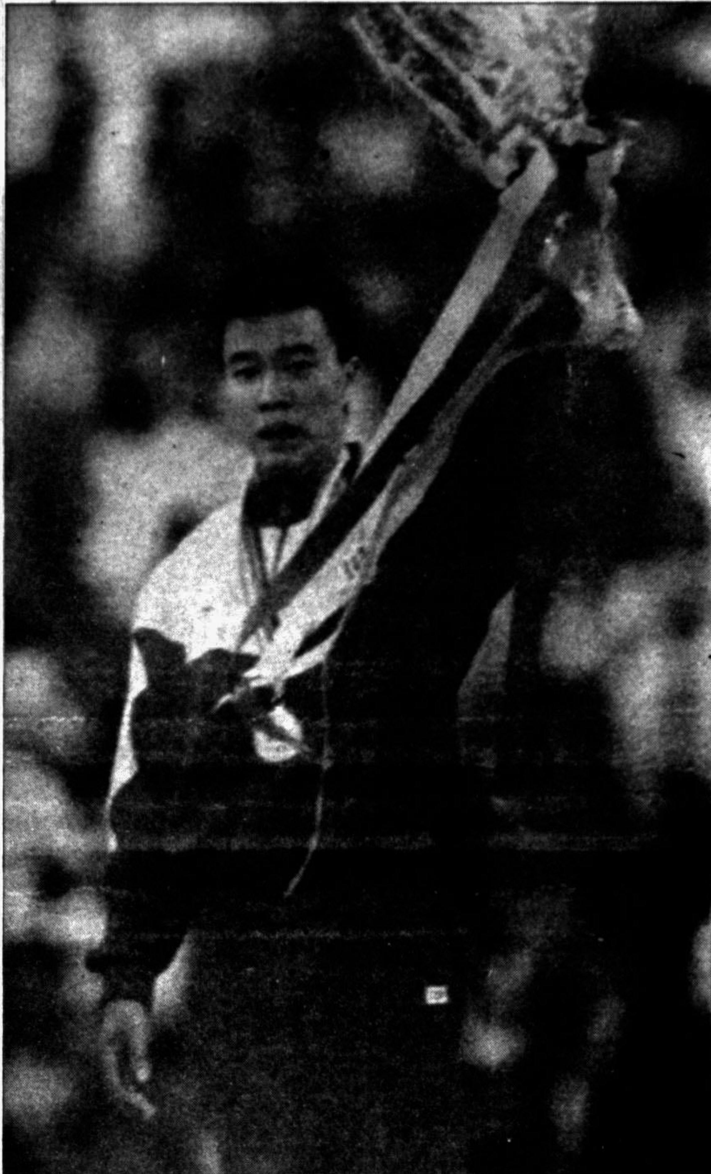
China's Li Jing salutes the crowd after receiving his gold medal for parallel bars in the men's individual event finals on September 15 at the World gymnastics championships in Indianapolis, Indiana. Li won the gold medal with a score of 9.862.