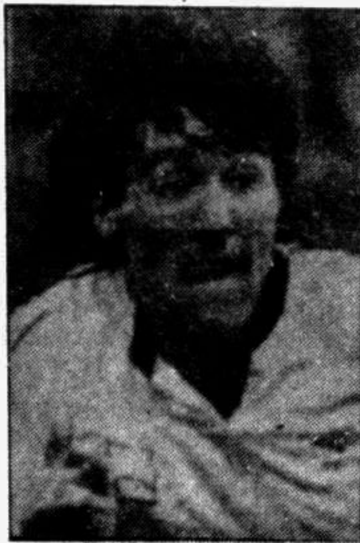
DEAN SAUNDERS Ian Rush, who started his season by playing the last 22 minutes against Villa, is likely to partner fellow Welshman Dean Saunders up front.