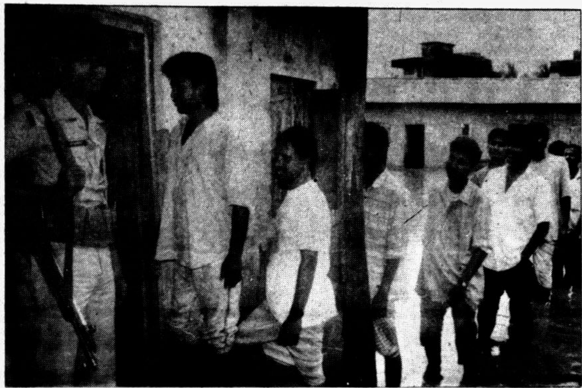
Voters waiting in a queue at a water-logged city polling centre to give their verdict in the referendum on Sunday.