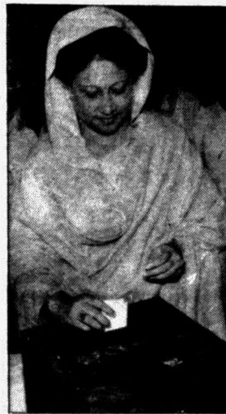
Prime Minister Begum Khaleda Zia casts her vote at Adamjee Cantonment College polling centre.