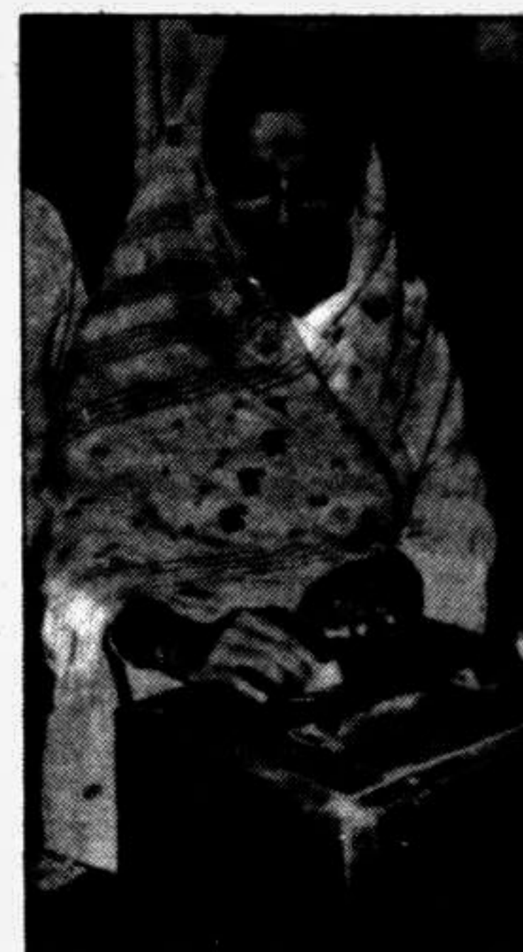
Leader of the Opposition in parliament Sheikh Hasina casting her vote at Dhanmondi Girls' High School polling station.