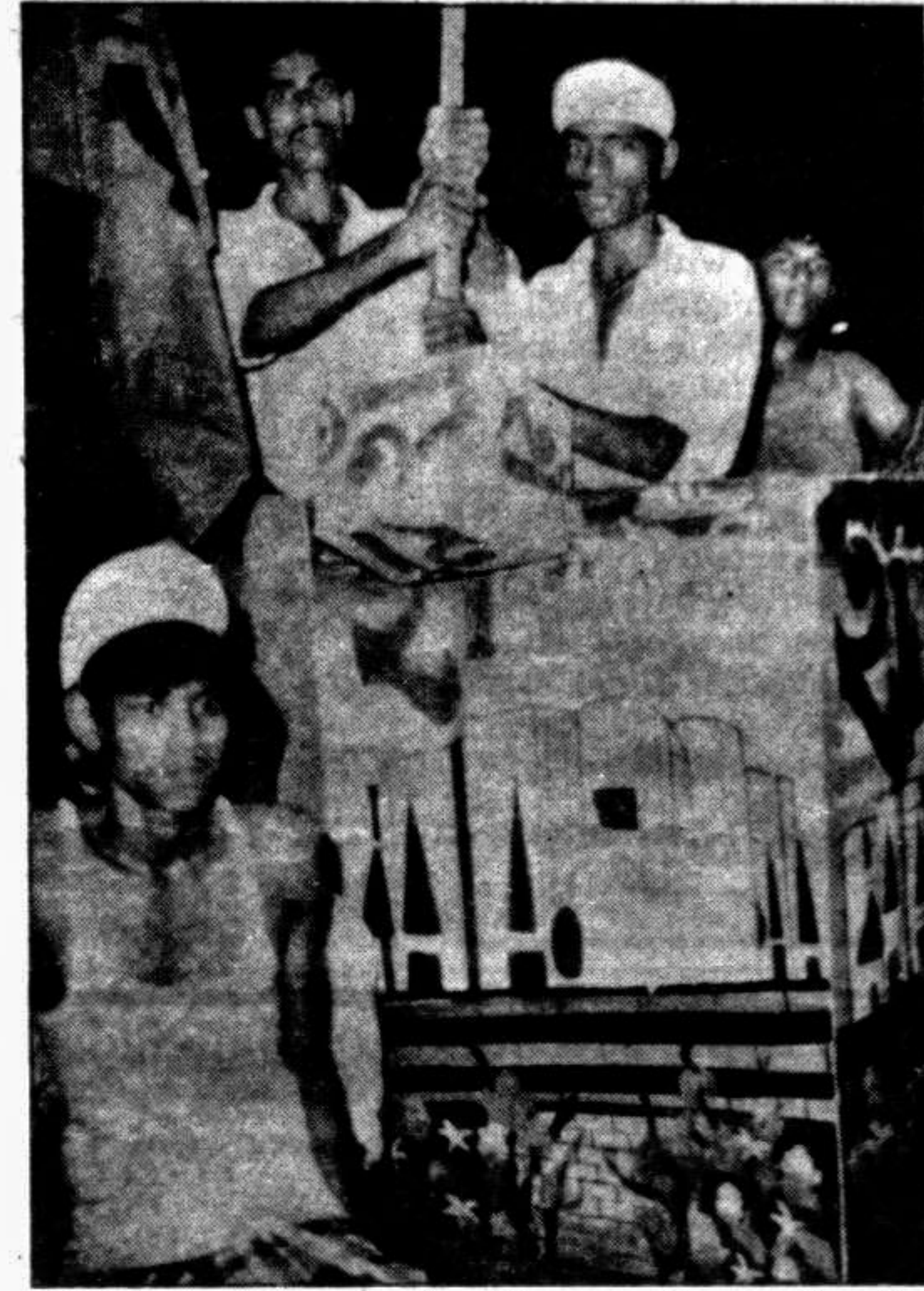
BNP brought out a colourful procession in the city Saturday to campaign for 'Yes' votes in today's referendum.