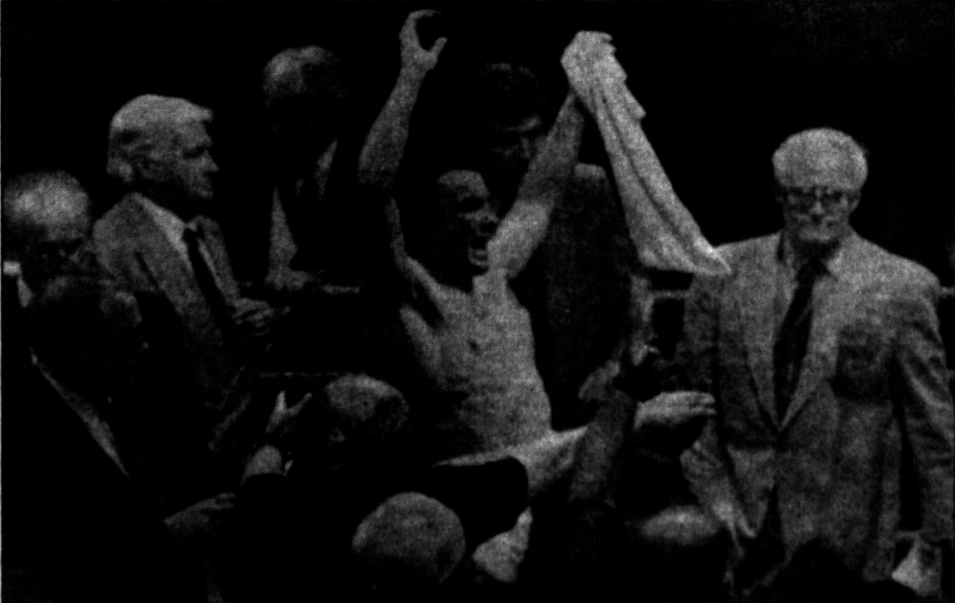
The new WBC Right Heavy weight world champion Jeff Harding of Australia celebrates after his victory over Dennis Andries in a split decision at the Hammersmith Odeon in London on Sept 11.

Andrie hoped to set up a rematch with Thomas Hearns, who beat him in 1987.